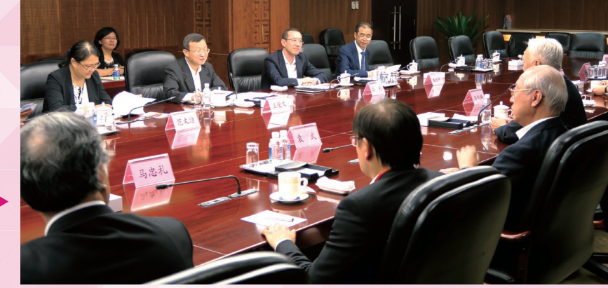
與商務部官員討論經貿議題。 Discussing economic and trade matters with officials from the Ministry of Commerce.

在京期間,訪問團先後會見全國政協港澳台僑委員會 主任楊崇匯、國務院僑辦主任裘援平、中央統戰部常 務副部長張裔炯、商務部副部長王受文、全國工商 聯副主席安十一及中國貿促會副會長于平等領導。 (19 - 22/7)