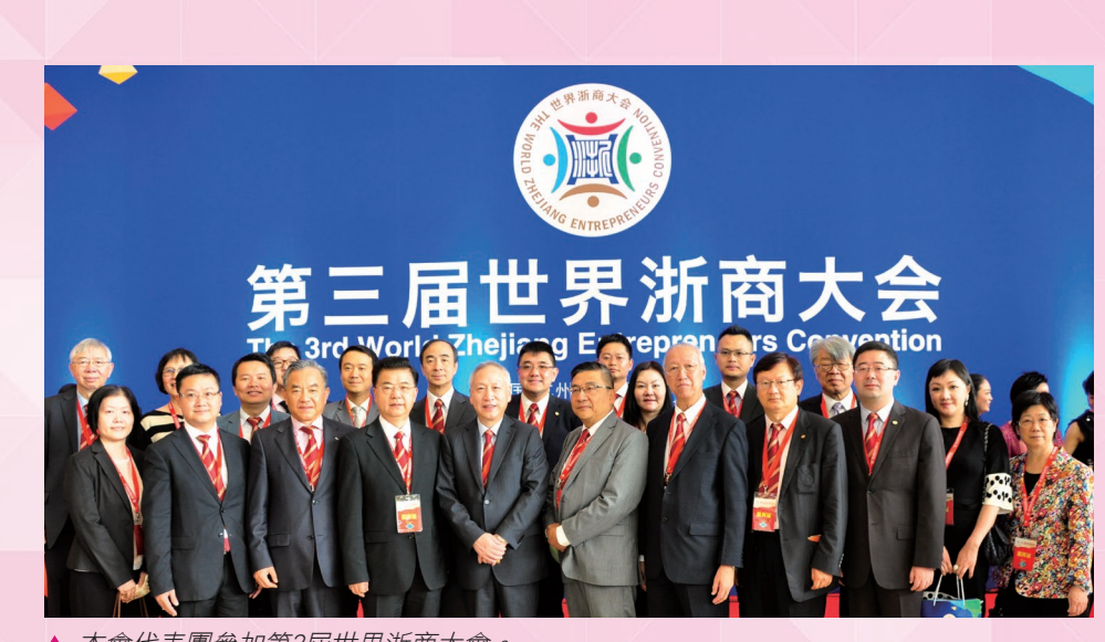
▲ 本會代表團參加第3屆世界浙商大會。 The delegation participates in the 3rd World Zhejiang Entrepreneurs Convention.

▲ 南沙考察團了解當地規劃。 The delegation to Nansha studies the local development plans.