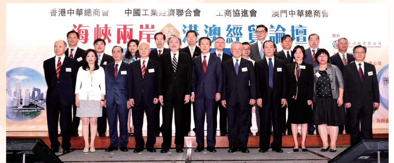
海峽兩岸暨港澳經貿論壇前瞻兩岸四地經貿合作新機。 The forum on economic ties among the Mainland, Taiwan, Hong Kong and Macau explored opportunities for cooperation among the four places.