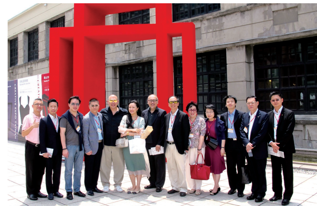
▲ 參觀台北的松山文創園區。 Visit at Songshan Cultural and Creative Park in Taipei.