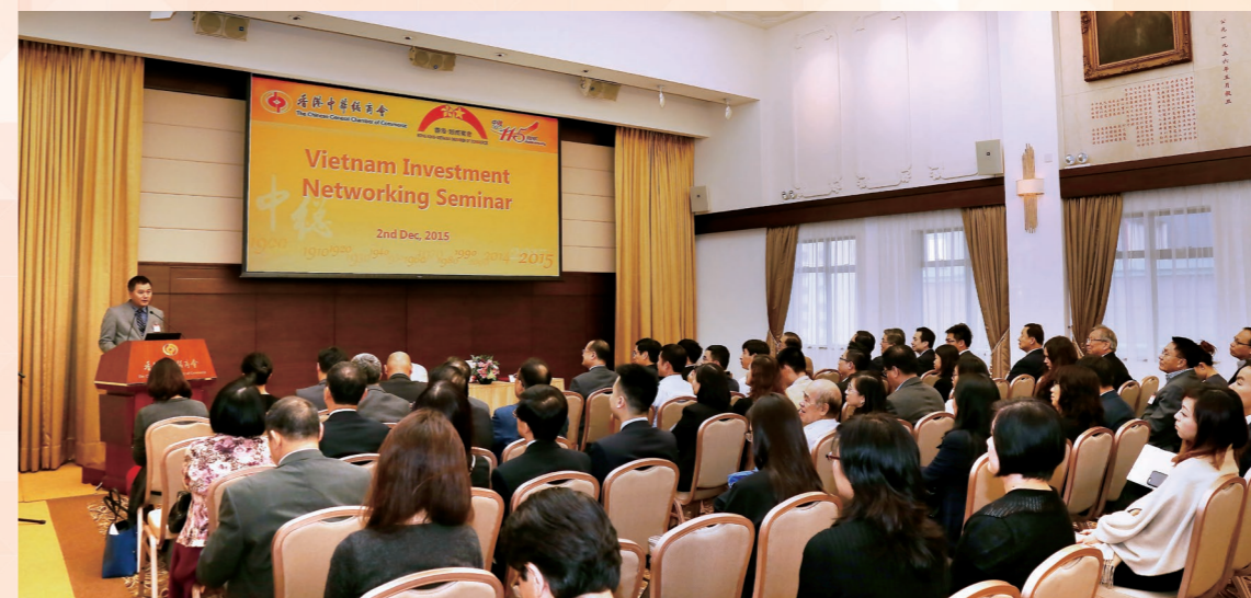
◀ 舉辦投資交流會，推動香港與越南工商界的交流合作。 The networking seminar for promoting business communication between Hong Kong and Vietnam.