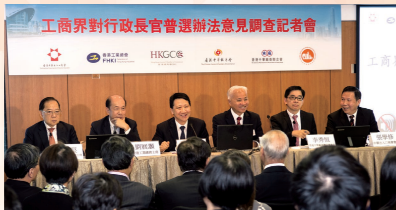
▲ 透過問卷調查了解會員對政改方案的看法。 A survey was organized to collect the members' view on the constitutional reform package.