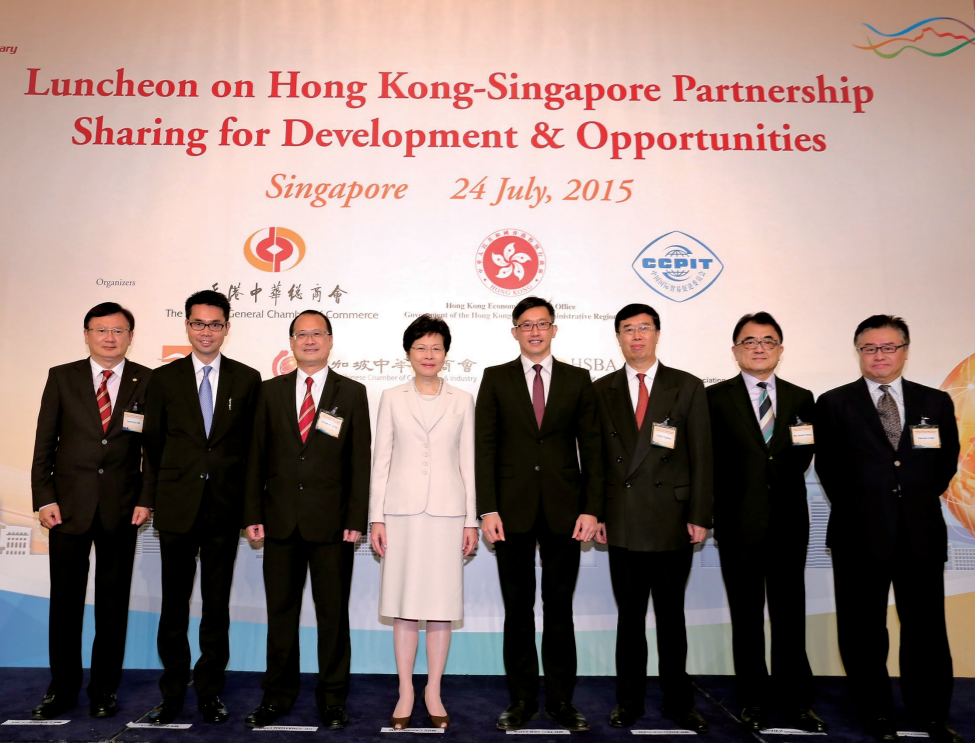
◀ 於新加坡舉行午餐會，促進香港和新加坡的經貿合作。 A luncheon was held in Singapore to enhance bilateral cooperation between Hong Kong and Singapore.