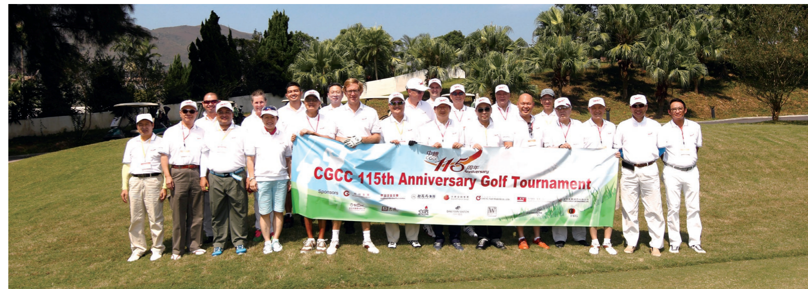
▲ 透過高爾夫球賽與駐港領事增進友誼。 The Chamber enhanced friendship with consulate officials in Hong Kong through golf games.

Held at the Discovery Bay Golf Club, the 2015 CGCC Golf Tournament cum Networking Dinner was participated by officials from many consulates and foreign chambers in Hong Kong. The event allowed Chamber's members and guests to enhance friendship in an exciting and friendly environment. (16/10)