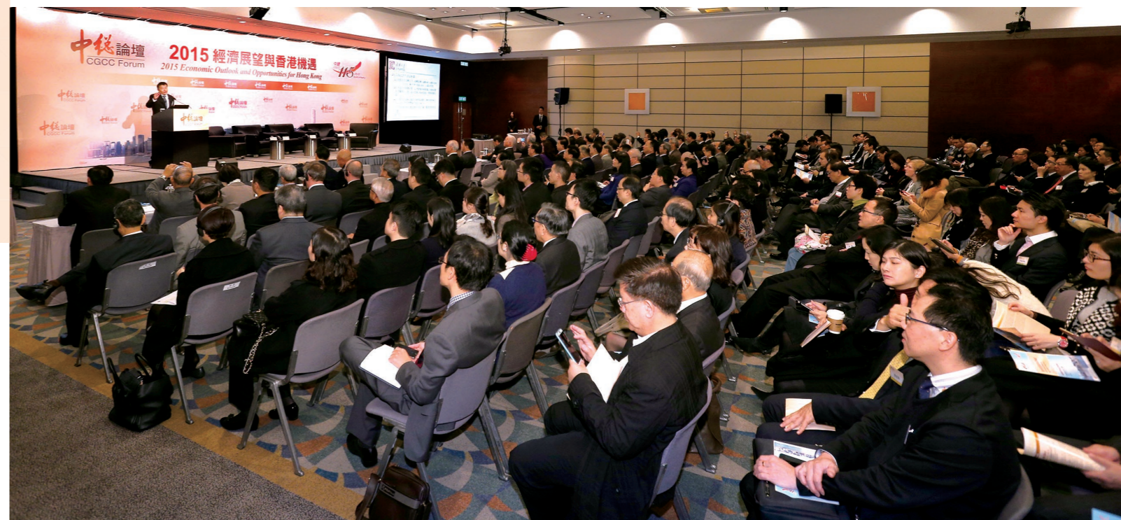
▲ 中總論壇吸引逾400名嘉賓出席。 Over 400 guests attended the CGCC Forum.