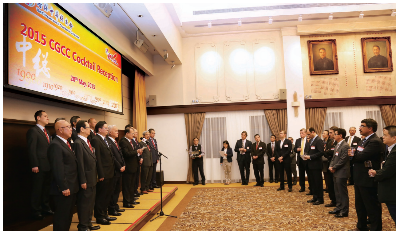
▲ 領事酒會已成為本會與各國駐港領事每年一度的聚會。 The CGCC Cocktail Reception has become an annual calendar event of many consulate officials in Hong Kong.