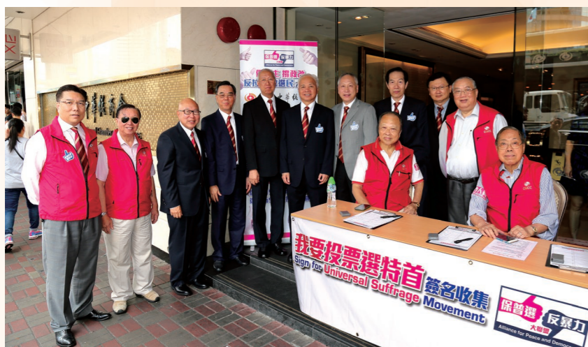
▲ 於會址設立簽名站，積極響應支持政改的簽名活動。 A signature point was set up at CGCC Building to support the constitutional reform.

此外，本會積極響應由“保普選 反暴力大聯盟”舉辦的“保民主 撐政改 反拉布 做選民”簽名活動，並於中總大廈地下大堂設立簽名站，收集近2,000個簽名。隨後本會聯同其他五大商會公佈就“行政長官普選辦法”具體方案向屬下會員收集意見的調查結果，當中逾九成支持方案。(9-17/5, 21/5)