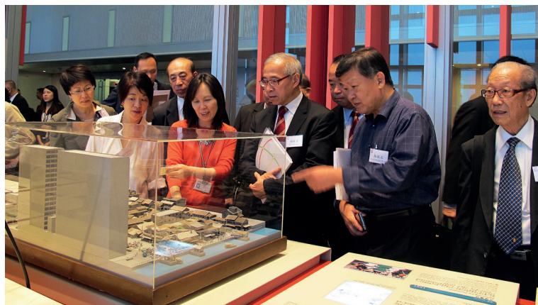
會員服務委員會參觀廉政公署。 The Members' Services Committee visits ICAC.