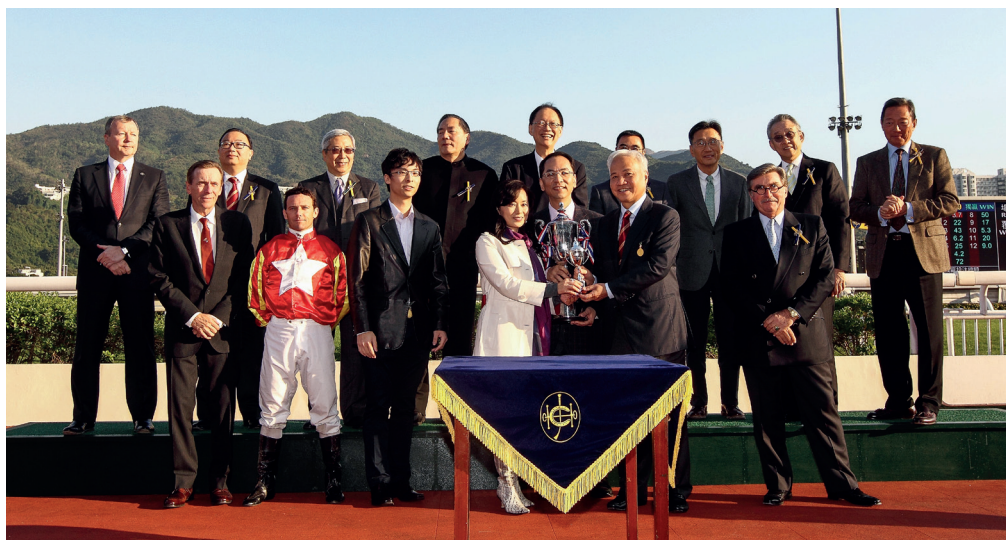
▲ 一年一度“中總盃”賽馬活動。 The annual CGCC Cup horse race.

The Members' Services Committee not only provides spending privileges but organizes various activities for CGCC members. Various seminars and workshops, social gatherings, as well as the annual CGCC Cup horse race were held during the year. Besides, welcome dinner receptions were held to orientate new members to the Chamber.