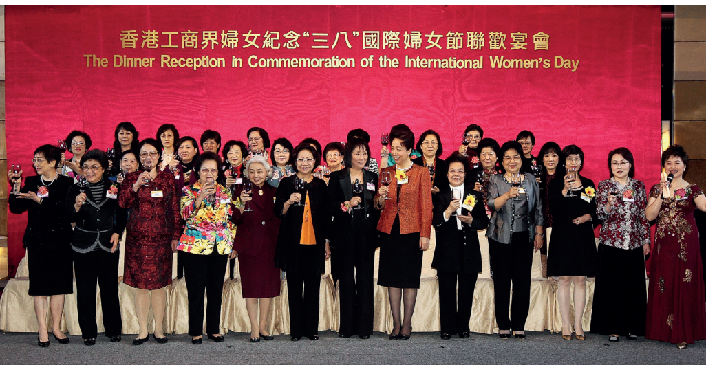
◀ “三八”國際婦女節聯歡宴會。 The dinner reception in commemoration of the International Women's Day.