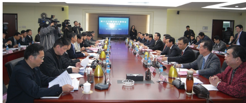
◀ 粵港澳主要商會高層圓桌會議。 The roundtable meeting among major chambers in Guangdong, Hong Kong and Macau.

第 13 屆粵港澳主要商會高層圓桌會議於南沙召開，本會代表與廣東、香港及澳門多家商會的高層探討三地經貿合作。是次會議上，各商會就廣州南沙新區社會經濟發展等議題交換意見，增進聯繫。(27/11)