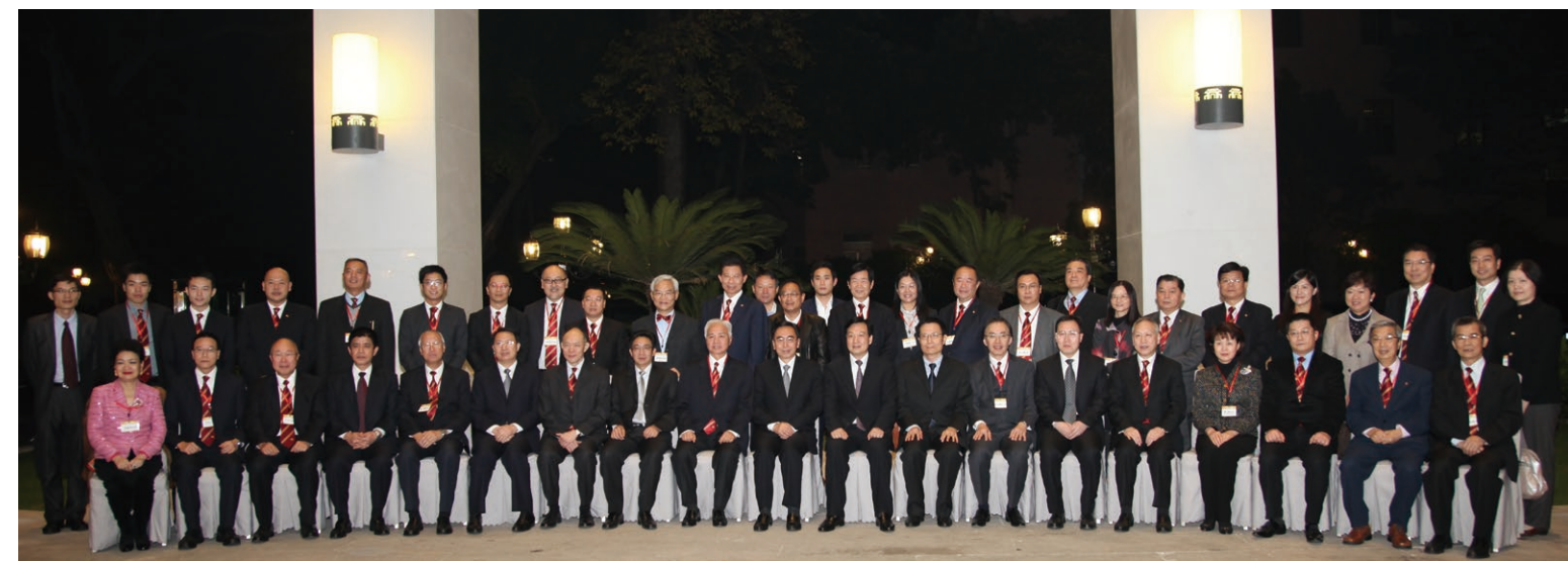
▲ 廣東省省長朱小丹（前排中）接見本會代表團。 Zhu Xiaodan (middle, front row), Governor of Guangdong, meets with the Chamber's delegation.

During the year, two delegations to Guangdong were organized to meet with officials such as Zhu Xiaodan, Governor of Guangdong Province; Wan Qingliang, Secretary of CPC Guangzhou Municipal Committee and Chen Jianhua, Mayor of Guangzhou. The delegates exchanged ideas with local officials on Hong Kong's economic partnership with Guangdong and Guangzhou, the liberalization of Guangdong-Hong Kong trade in services, the upgrade and transformation of Hong Kong enterprises, and the urbanization of Guangzhou. Another topic touched upon was the development of the Nansha, Qianhai and Hengqin areas. The province's leaders expressed their hope that the Chamber would further encourage Hong Kong enterprises to participate in the three areas' development. (19/4 & 13/12)