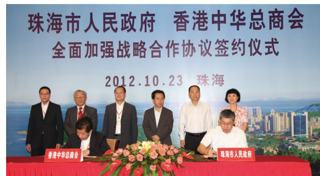
▲ 與珠海市政府簽署合作協議。 Signing the cooperation agreement with the Zhuhai Government.