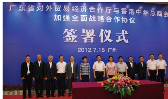
▲ 與廣東省外經貿廳簽署合作協議。 Signing the cooperation agreement with DOFTEC.