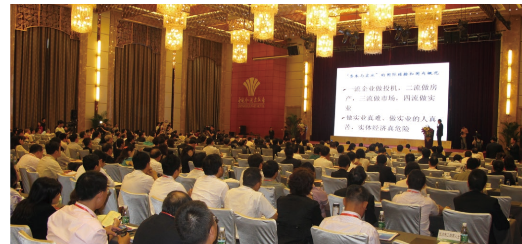
▲ “2012 世界華商領袖峰會”吸引內地企業家、港澳台及海外華商等逾 400 人出席。

The luncheon speech of the celebration examines economic trends.