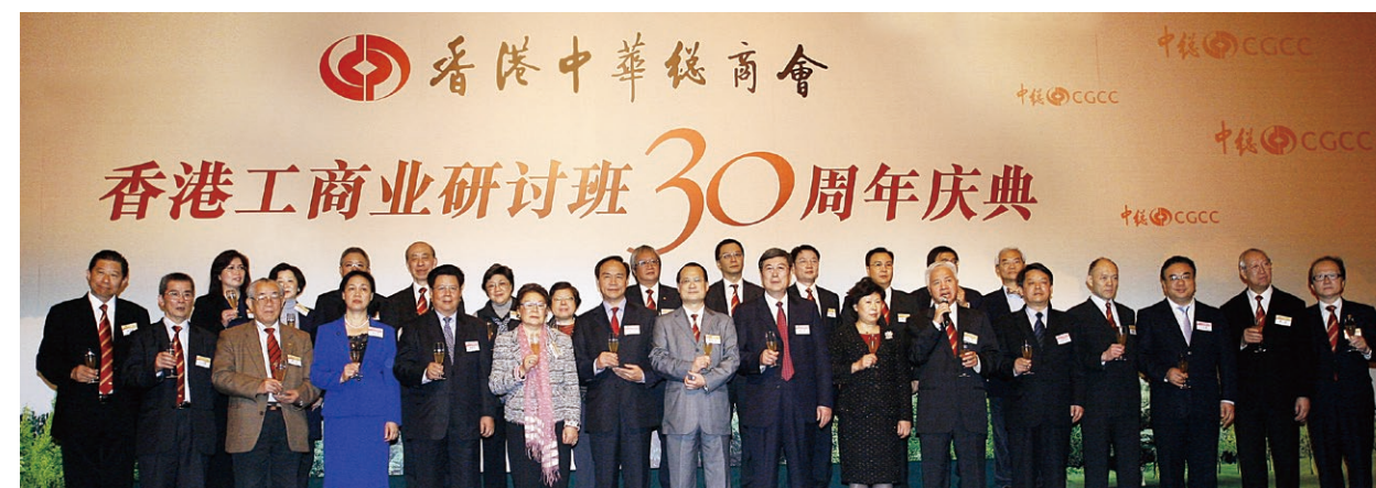
▲ 本會首長聯同主禮嘉賓舉杯慶賀研討班 30 周年。 Together with the officiating guests, the Chamber's chiefs propose a toast to the guests at the Training Program's 30th anniversary celebration.