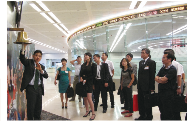
◀ 研討班學員參觀新立法會大樓及香港交易所。 Participants of the Training Program visit the new LegCo Complex and the HKEx.

During the year, over 70 seminars, trade fairs, exhibitions and conferences were organized in Hong Kong or the Mainland in collaboration with Mainland government departments and business organizations.