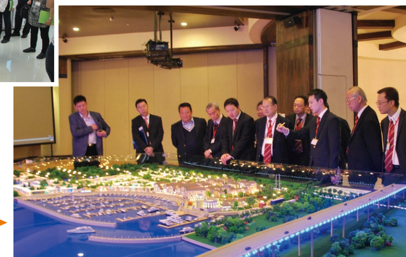
▶ 南沙考察團了解當地規劃。 The delegation to Nansha studies the city's development plans.