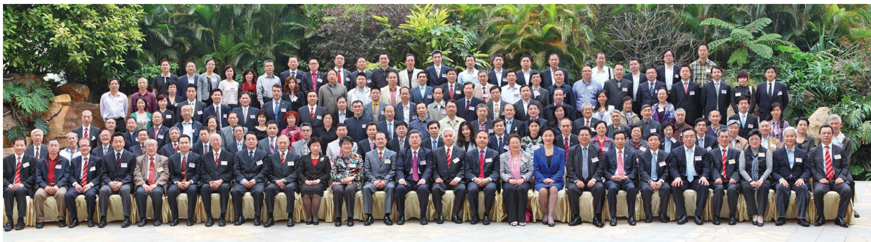
▲ 內地多位領導、研討班歷屆講師和學員逾 200 人應邀參加研討班 30 周年慶典。

Present at the Training Program's 30th anniversary celebration were over 200 guests, who were Mainland officials, as well as instructors and participants of the program.