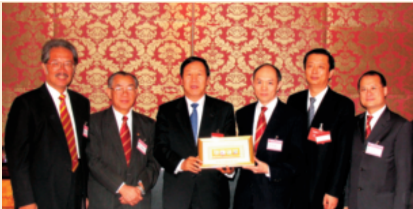
◀ 天津市戴相龍市長（左三）接受本會致送之紀念品。

Mr Dai Xianglong (third from left), Mayor of Tianjin, receives a memento from the Chamber.