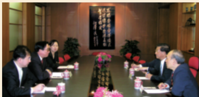
◀ 監察部李玉賦副部長（左二）與本會成員交流。

Presenting a memento to Mr Cheng Siwei (fourth from right), Vice-chairman of the Standing Committee of the National People's Congress.