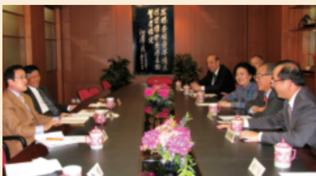
▲ 中國人民銀行項俊波副行長（左一）與本會成員交流。

Receiving Mr Gao Hucheng (third from left), Vice Minister of Ministry of Commerce.