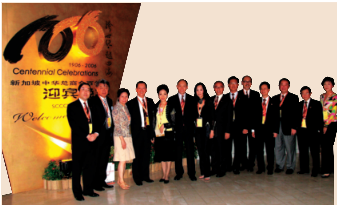
◀代表團成員出席新加坡中華總商會創會100周年的慶祝活動。

The delegation attends the centennial celebrations of the Singapore Chinese Chamber of Commerce & Industry.