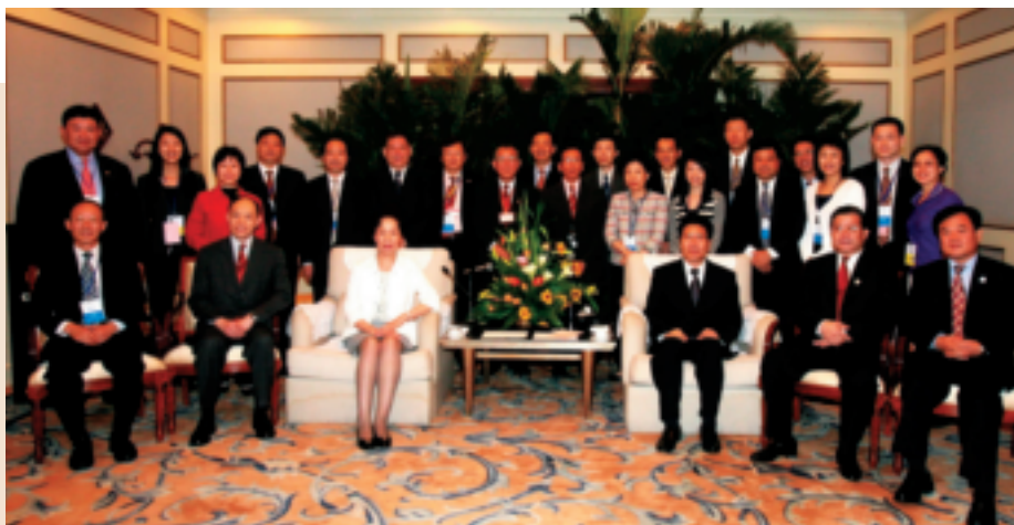
▲ 訪問團成員出席 "首屆中博會"，並與湖南省委張春賢書記（前排右三）會面交流。

The delegation attends "The 1st Expo Central China" and exchanges views with Mr Zhang Chunxian (third from right, front row), Secretary of CPC Hunan Provincial Committee.