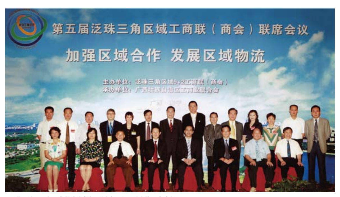
▲ 港、澳及9省工商聯代表就加強泛珠三角區域合作分享意見。 Views on Pan-PRD regional cooperation are shared among representatives from chambers of commerce in Hong Kong, Macau, as well as Federations of Industry & Commerce in 9 Mainland provinces.

"第5屆泛珠三角區域9+2工商聯(商會)聯席會議" 於廣西南寧市舉行,會上來自港、澳及9省的參加 者分享意見。本會代表建議強化交通網絡以推進泛 珠區域物流發展,並提議商會扮演泛珠與東盟的橋 樑。會議通過"加強泛珠三角區域合作,構建現代 區域物流體系"報告。(9-10/6)