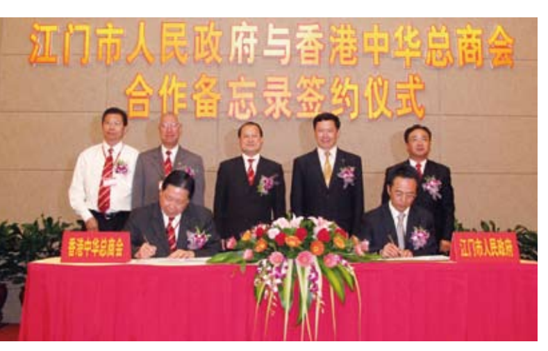
▲ 本會與江門市政府共同開拓機遇。 Exploring opportunities with Jiangmen Municipal Government.