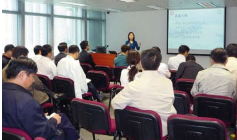
研討班學員透過參觀考察和各種活動,了解香港商業情況。 Training program participants get more understanding of Hong Kong business through various activities.