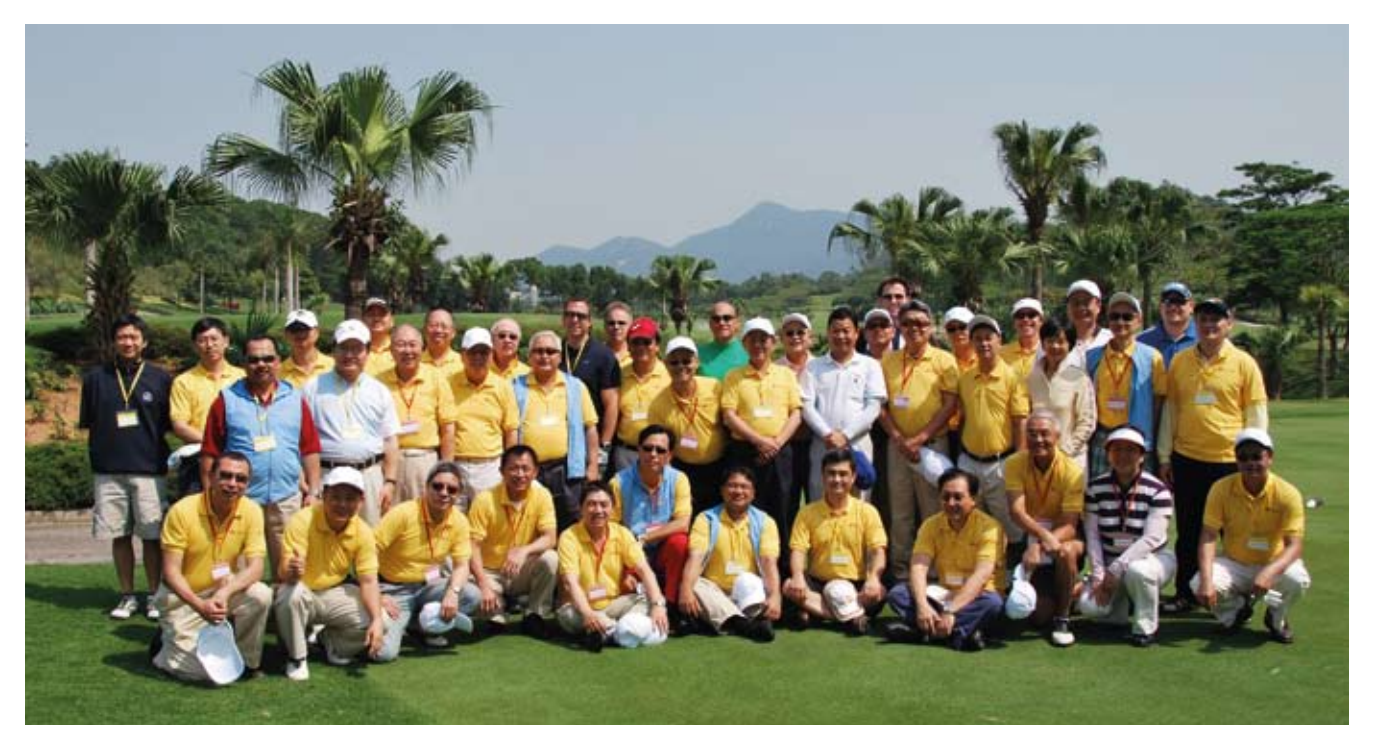
▲ 多國駐港領事參加領事哥爾夫球賽。 Consuls general in Hong Kong participate in the Consulate Golf Tournament.