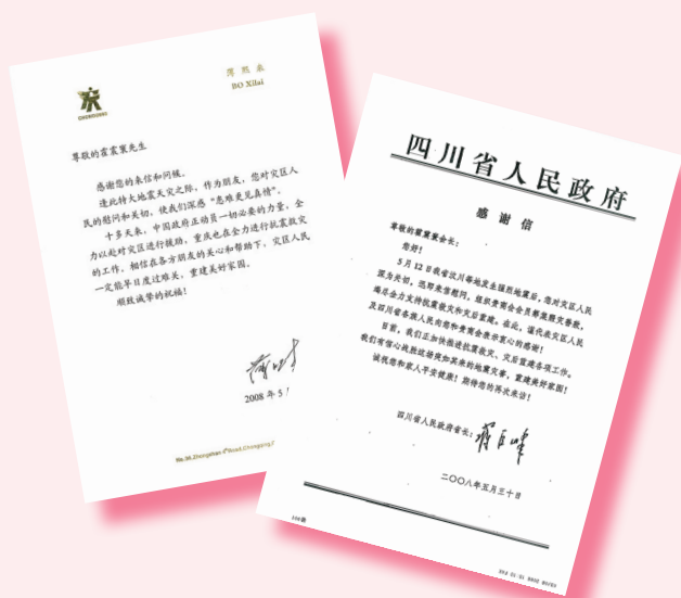
◀ 重慶市市委及四川省政府回函本會致謝。 The Chamber receives appreciation letters from CPC Chongqing Municipal Committee and Sichuan Provincial Government respectively.

After the tragedy, the Chamber also wrote to the provincial and municipal governments of Sichuan and Chongqing to express our sympathy and care. Mr Bo Xilai, Secretary of CPC Chongqing Committee, and Mr Jiang Jufeng, Governor of Sichuan Province, replied in appreciation of our assistance and concern.