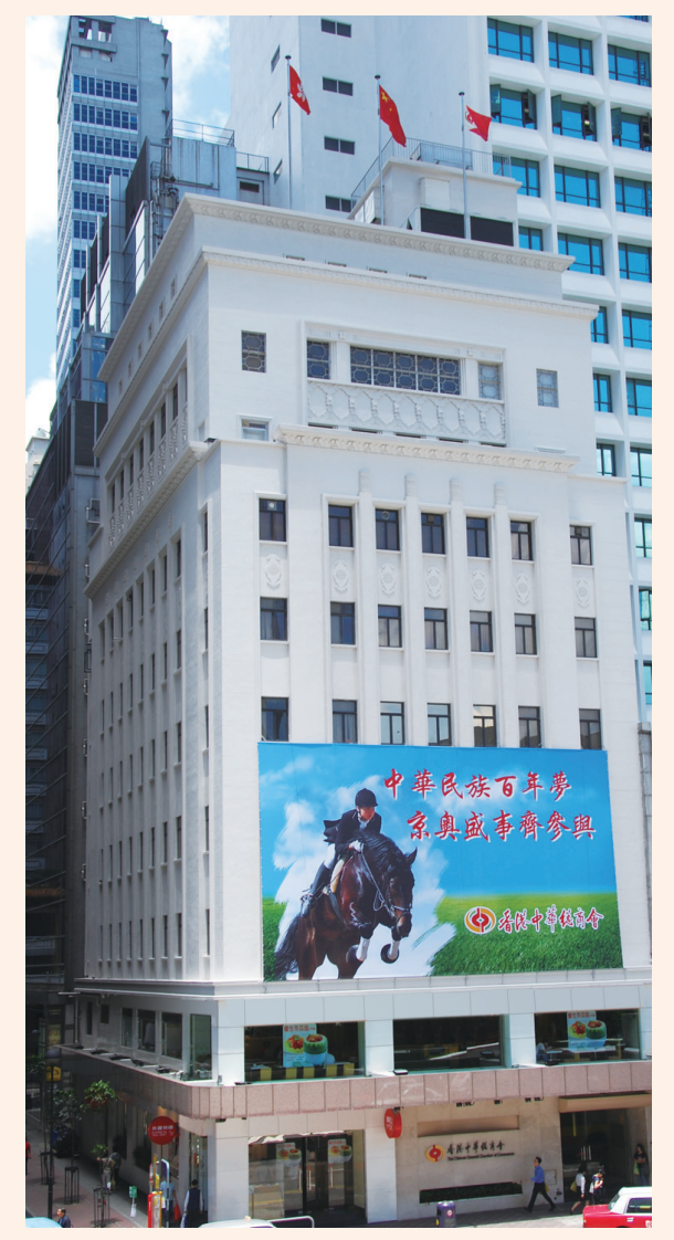
▲ 本會大廈外牆懸掛大型海報,祝願北京奧運圓滿成功。 The exterior wall of the Chamber's building is hung with a jumbo banner of wishing Beijing Olympics a great success.

As a statement of our support for the Beijing Olympics, a jumbo banner entitled "Share the Joy of Beijing Olympics, the Century-old Dream of Chinese People" was hung outside the Chamber's building, echoing the passion of the public for this grand occasion.