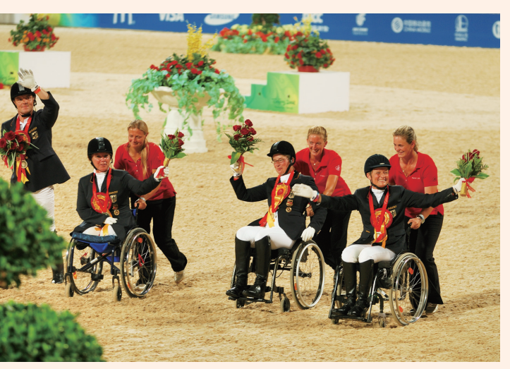
▲ 亞軍:同一奧運 同一載譽 The First Runner-up: Medal Winners