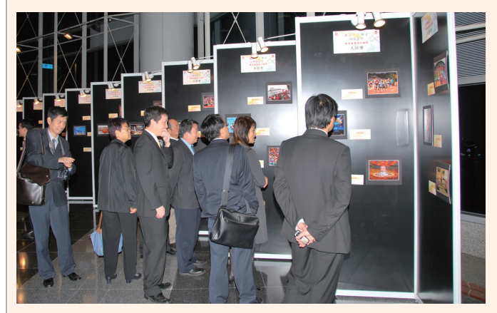
▲ 會董就職典禮上,來賓觀賞獲獎作品。 Guests of the board inaugural ceremony see the awarded photos.

The awarded photos were then showcased at the 46th board inauguration ceremony for members to savor the great moments and review the journey of the successful realization of China's Olympic dream.