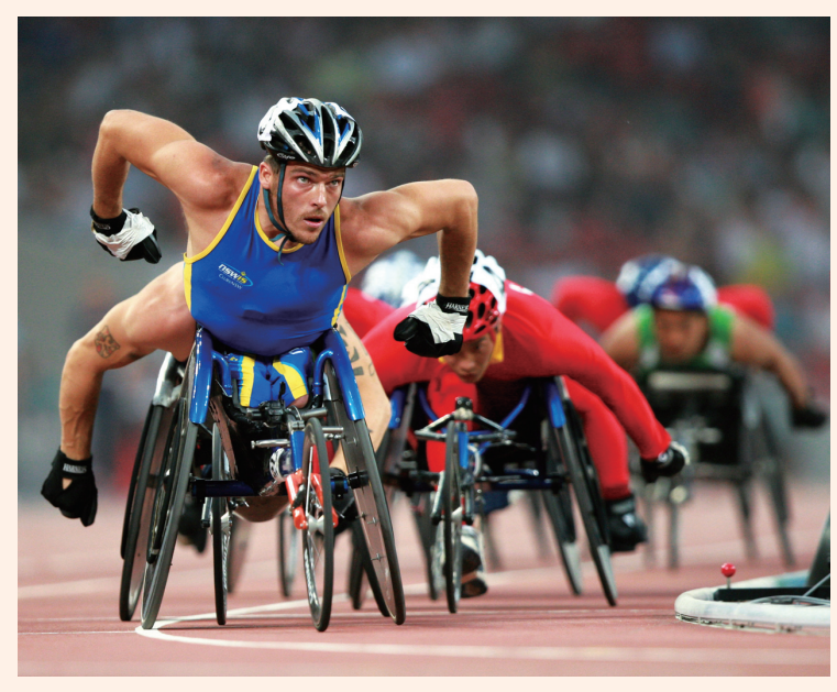
▲ 冠軍:飛翔 The Champion : Fly