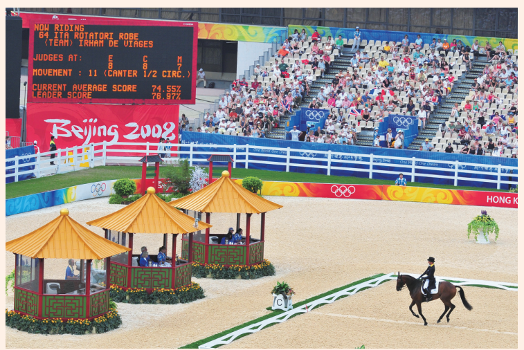
▲ 冠軍:獨步賽場 The Champion : Solo