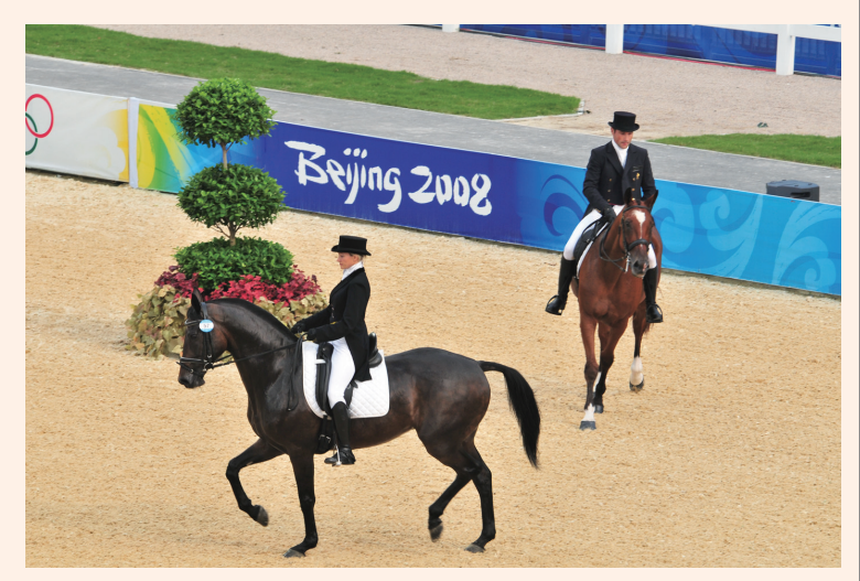
▲ 季軍:巾幗不讓鬚眉 The Second Runner-up : Heroine