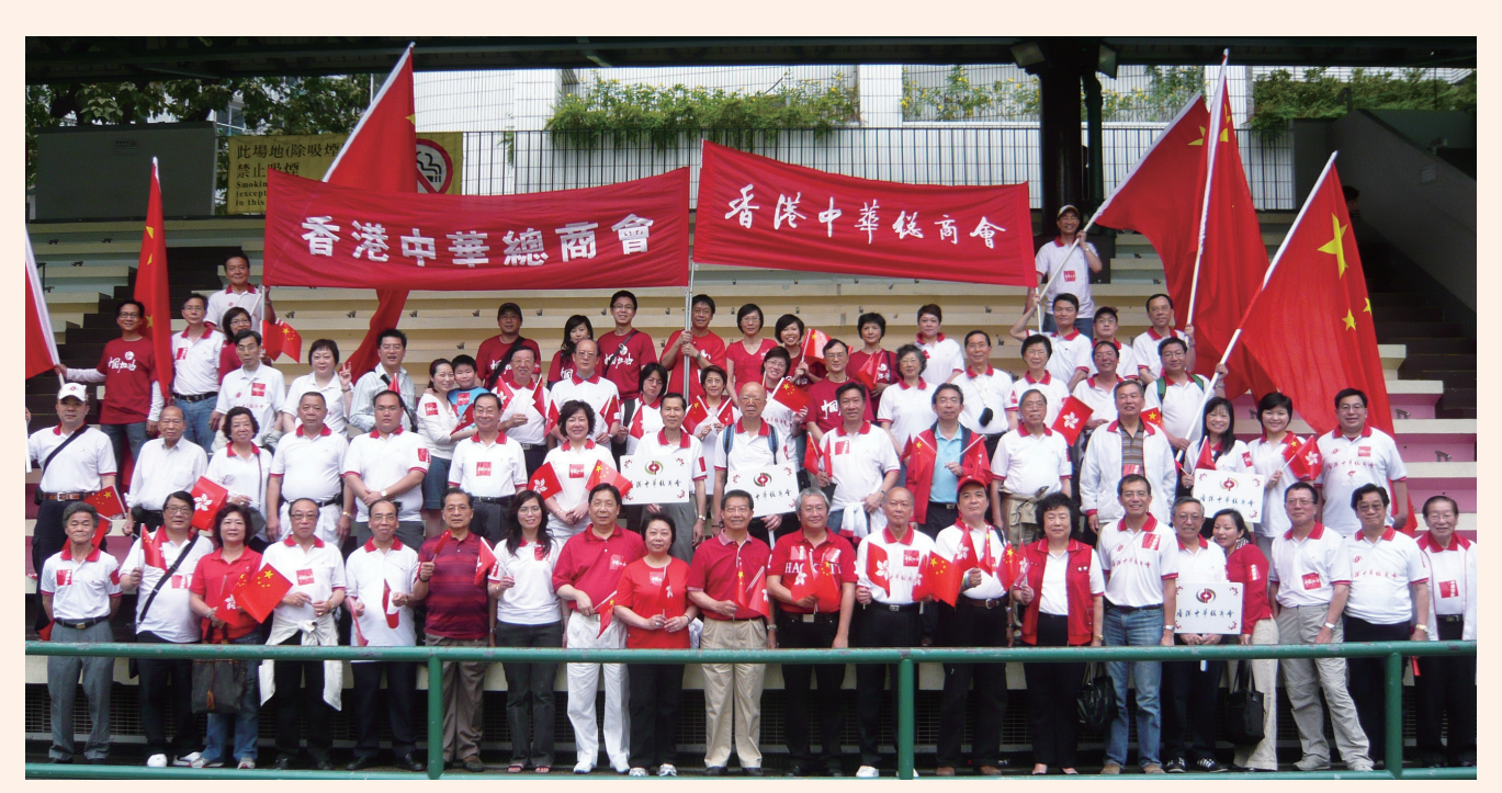
▲ 本會成員沿途為火炬手打氣。 Members of the Chamber cheering the torchbearers along the way.

The Olympic flame, after being passed along five continents for months, arrived at Hong Kong, the first stop of the torch relay on Chinese land. A number of the Chamber's members were duly bestowed the honor to act as the torchbearers and passed on the torch amid the cheers of Hong Kong people, among them were members from the Chamber as well, manifesting the spirit of the Olympic Games. (2/5)