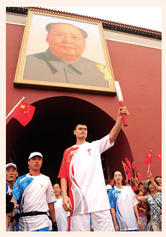
▲ 亞軍:前進!前進!前進進!!! The First Runner-up : Moving Forward