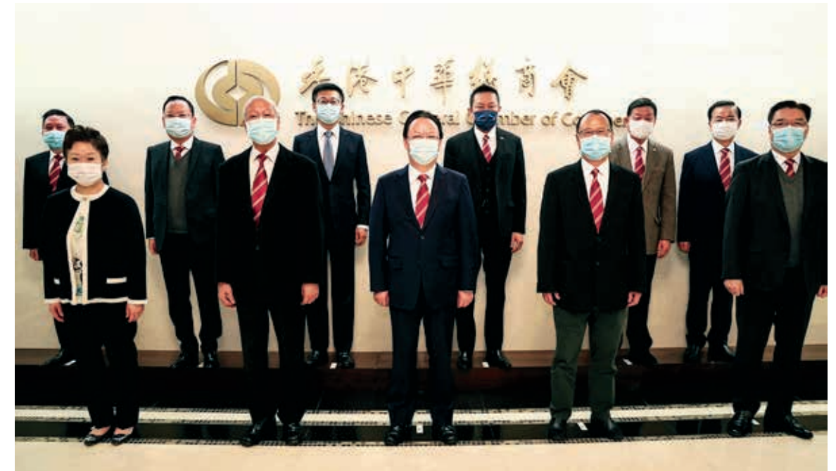
▲ 中聯辦副主任譚鐵牛 (前排中) Tan Tieniu (middle, front row), Deputy Director of the Liaison Office of the Central People's Government in the HKSAR