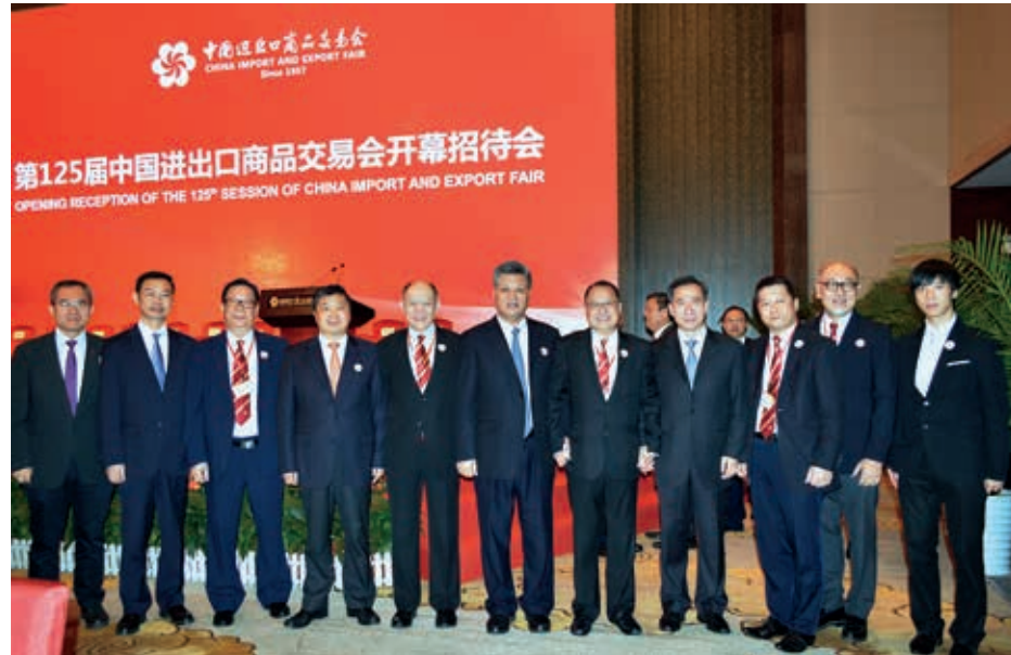
◀ 廣交會上，本會成員與廣東省省長馬興瑞（中）會面。 Posing with Ma Xingrui (middle), Governor of Guangdong Province at the Canton Fair.

每年均應邀參加春秋兩季“中國進出口商品交易會”（“廣交會”），致力推動內地進出口貿易發展。年內，第125屆（春季）及第126屆（秋季）廣交會在廣州舉行，代表團除出席開幕式、參觀展覽外，並與多位官員會面，工商促進外貿經濟。（15/4、15/10）