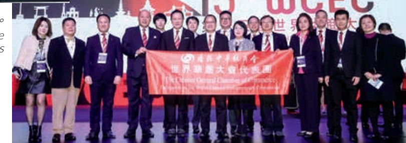
▲ 代表團出席第15屆世界華商大會。 The delegation at the 15th WCEC.