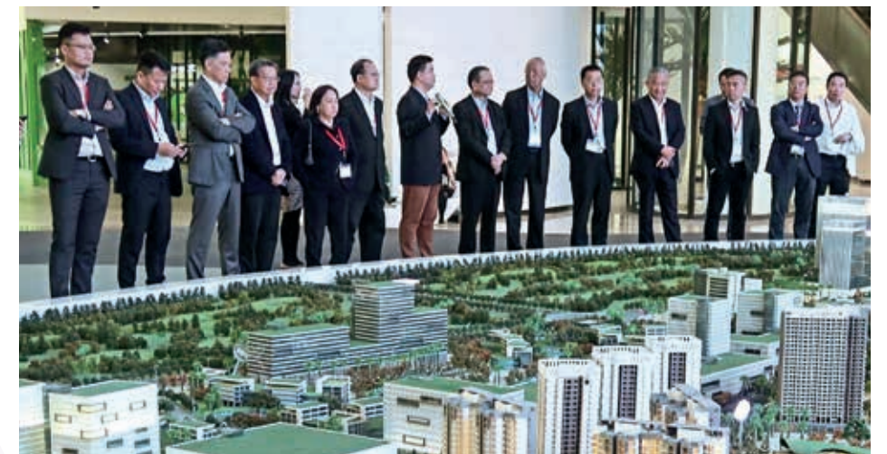
▶ 海南考察團參觀海口綜合保稅區。 The delegation to Hainan visits the bonded trade area in Haikou.