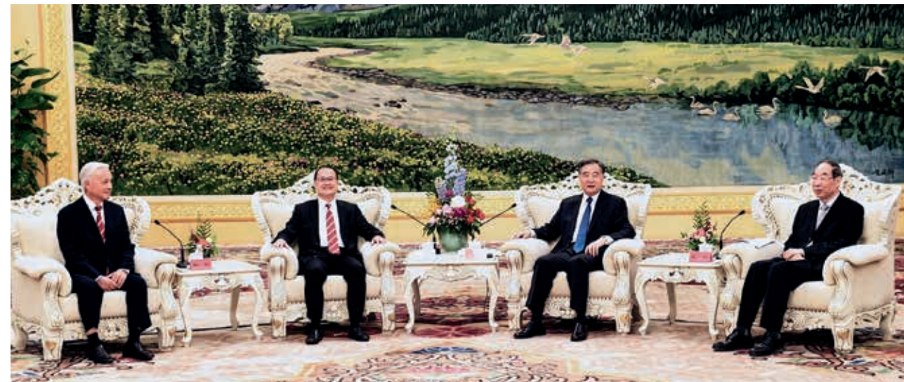
▲ 就香港事務與汪洋主席（右二）交流意見。 The delegation exchanges views on Hong Kong affairs with CPPCC Chairman Wang Yang (second from right).

Wang also said that the Chamber has always supported the HKSAR Government and Chief Executive after reunification. He also praised the Chamber for being an important force of loving both the country and Hong Kong and setting a good example for the Hong Kong business community. Since the founding of the PRC 70 years ago, the Chamber has always stood on the side of the motherland and the people to drive the Hong Kong business community to engage in the country's reform and opening-up.