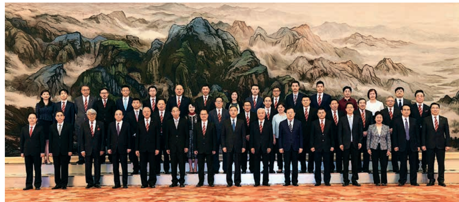
▲ 訪京團與汪洋主席（前排中）、中央統戰部尤權部長（前排左六）、全國政協夏寶龍副主席（前排右六）、張喬炯常務副部長（前排左四）及張曉明主任（前排右四）合照。 The delegation poses with CPPCC Chairman Wang Yang (middle, front row), Head of the UFWD You Quan (sixth from left, front row), CPPCC Vice-Chairman Xia Baolong (sixth from right, front row), Executive Deputy Head Zhang Yijiong (fourth from left, front row) and Director Zhang Xiaoming (fourth from right, front row).