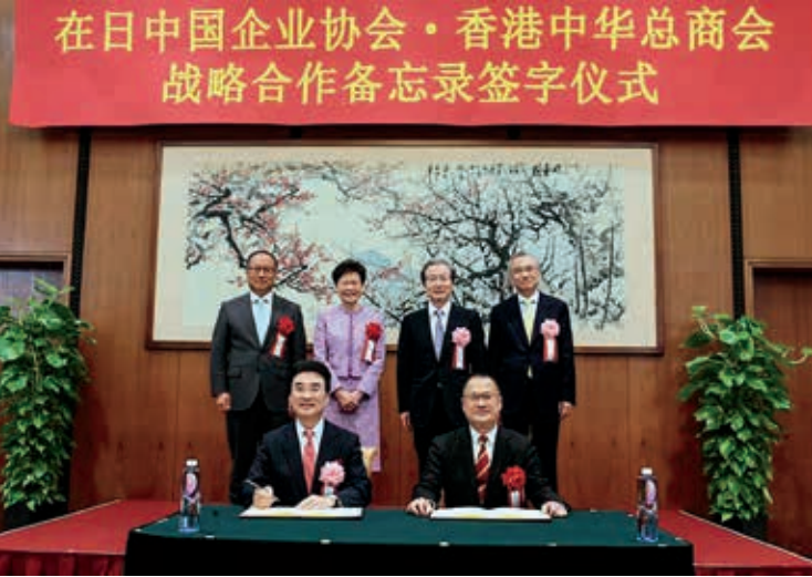
◀ 與在日中國企業協會簽署戰略合作備忘錄。 Signing the memorandum of strategic cooperation with the China Enterprises Association in Japan.