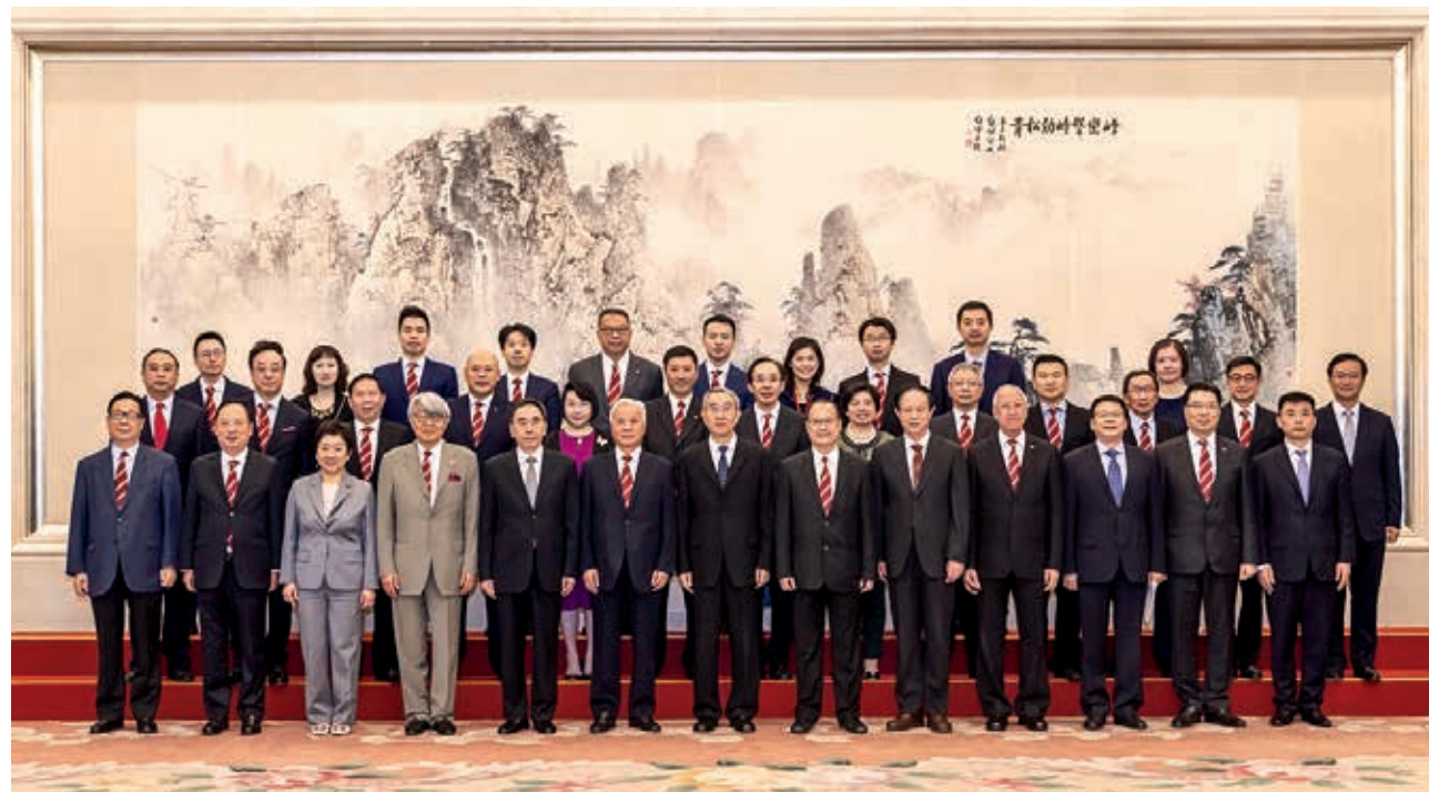
▲ 全國政協副主席馬飈 (前排中) 接見訪京團。 CPPCC Vice-Chairman Ma Biao (middle, front row), receives the delegation.