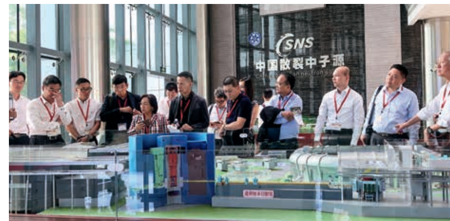
◀ 東莞、惠州考察團到訪中國散裂中子源。 The delegation to Dongguan and Huizhou visits China Spallation Neutron Source.