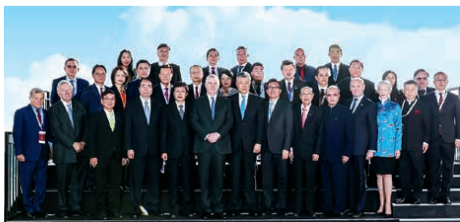
▲ 安德魯王子 (前排左六) 與來自世界各地的華商機構代表合照。 Prince Andrew (sixth from left, front row), poses with some representatives of the Chinese entrepreneurs organizations worldwide.

Forums were held during the three-day convention, the Chamber’s members were invited to speak on topics relating to Chinese entrepreneurs’ development. (21-23/10)