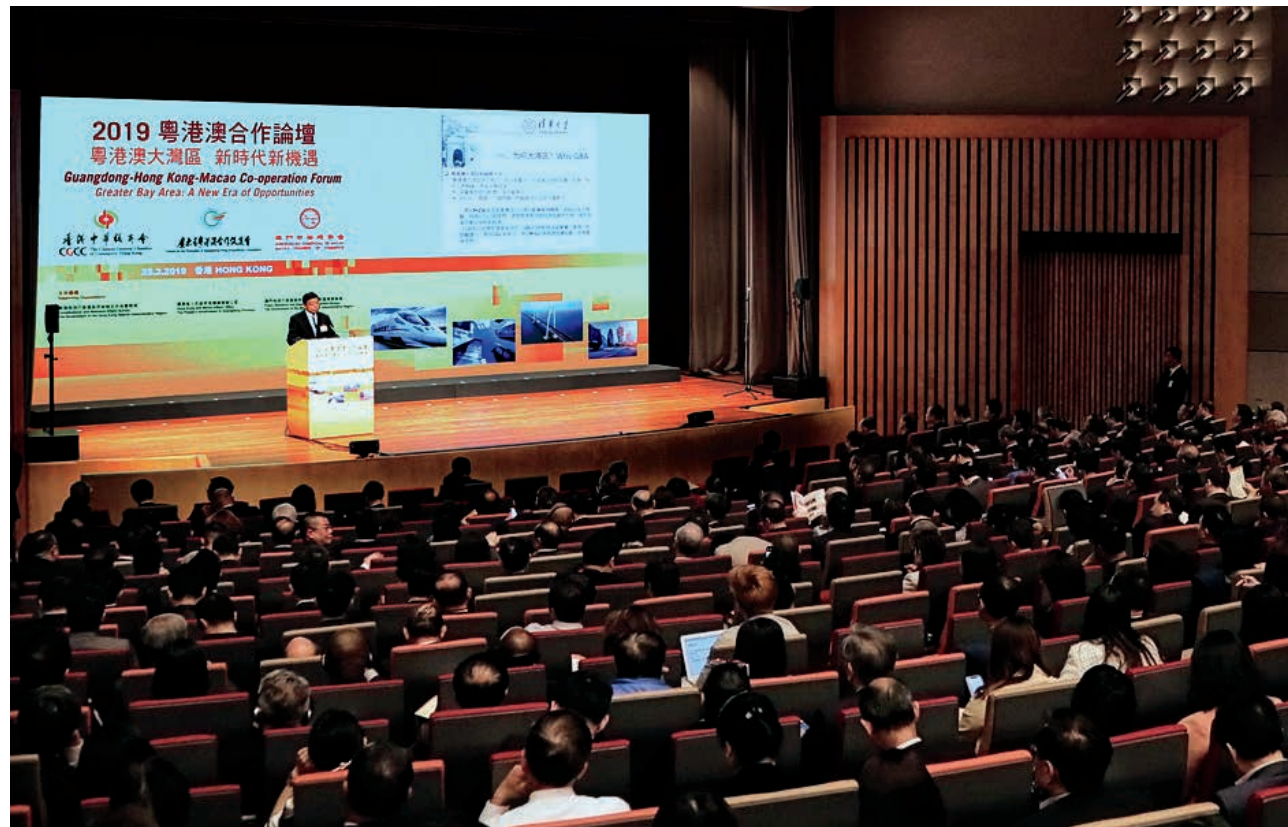
▲ 粵港澳合作論壇探討大灣區優勢。 Guangdong-Hong Kong-Macao Co-operation Forum explores Greater Bay Area's Advantages.