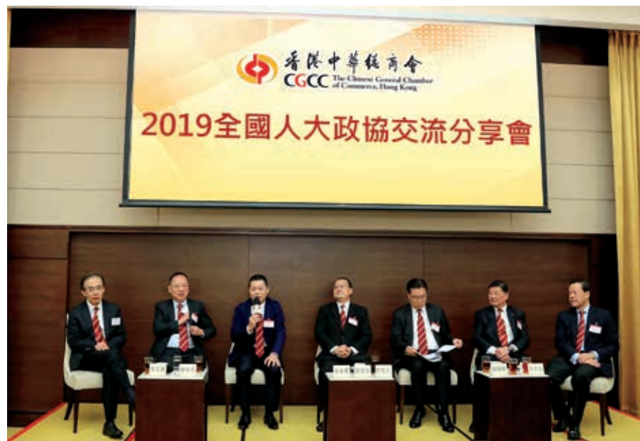
◀ 全國人大政協交流分享會探討“兩會”重要精神。 NPC & CPPCC Exchange and Sharing Meeting examines the key points of the “Two Sessions”.

The 20th high-level roundtable meeting among major chambers of commerce in Hong Kong, Guangdong and Macao was held at the Chamber’s hall. Representatives from major chambers in the three places discussed how the chambers of commerce play a role in the construction of the Guangdong-Hong Kong-Macao Greater Bay Area, and help the enterprises in the three places to grasp the development opportunity. (18/12)