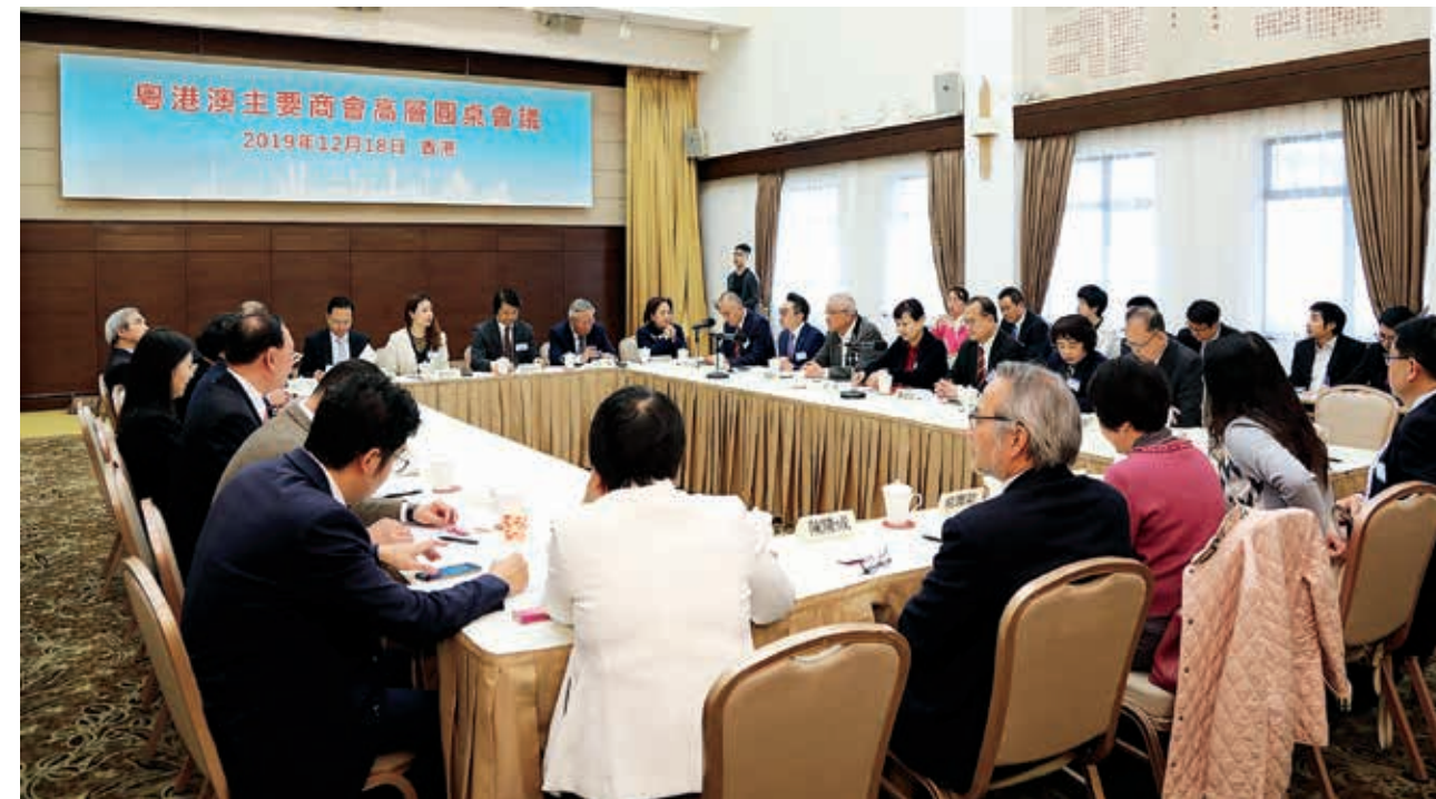
▲ 第 20 次粵港澳主要商會高層圓桌會議於香港召開。 The 20th high-level roundtable meeting among major chambers of commerce in Hong Kong, Guangdong and Macao was held in Hong Kong.