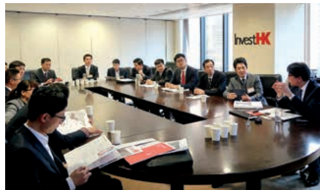
▲ 研討班學員參觀投資推廣署及香港金融管理局。 Participants of training program visit InvestHK & Hong Kong Monetary Authority.