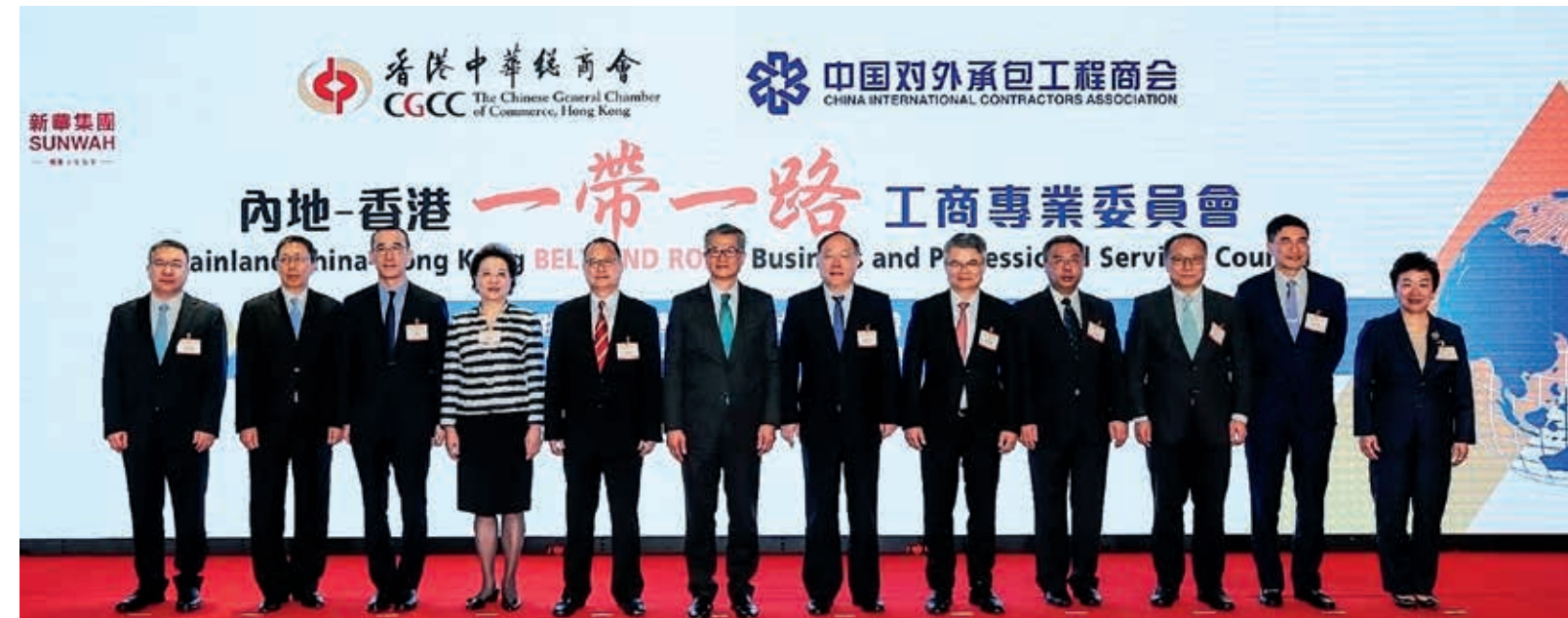
▲ 一帶一路項目與專業服務對接交流會為促進內地與香港企業深化“一帶一路”市場合作搭建互動平台。 Symposium on Belt and Road Business Co-operation serves as an interaction platform for Mainland and Hong Kong enterprises to deepen practical cooperation in the B&R market.