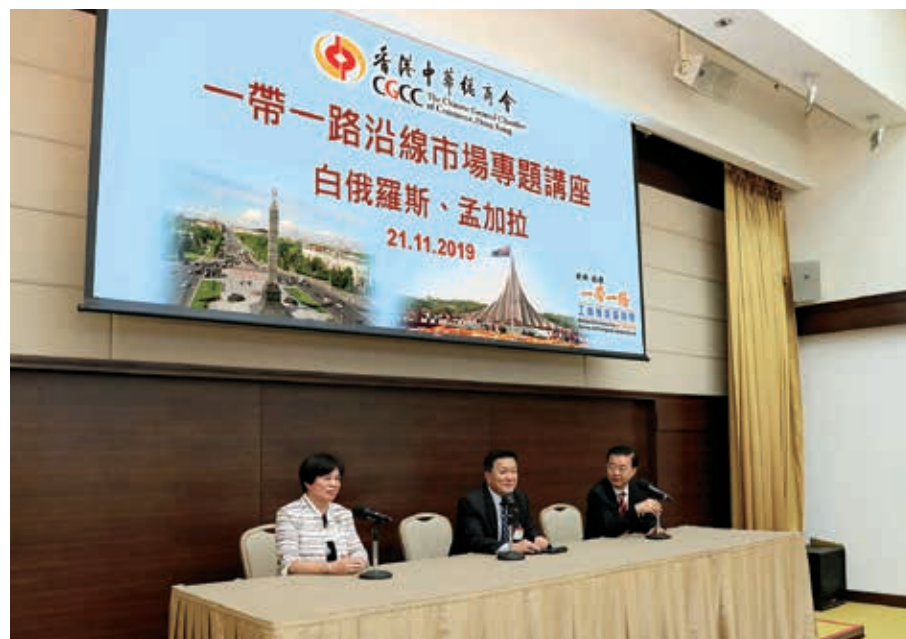
◀ 年內舉行多元化專題講座。 Seminars held in the year covered various topics.

Seminars were held to keep members updated on the business environment of the Mainland. Topics of seminars held in the year covered Tax Policy of Mainland, “Belt and Road” initiative and Guangdong-Hong Kong-Macao Greater Bay Area.