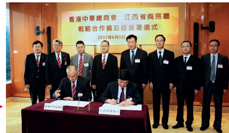
與江西省商務廳簽署戰略合作備忘錄。 Signing memorandum of strategic cooperation with Department of Commerce of Jiangxi Province.