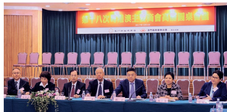
◀ 粵港澳主要商會高層圓桌會議探討商會如何在大灣區建設中發揮作用。 The high-level roundtable meeting discussed how the chambers of commerce can play a role in the construction of the Greater Bay Area.

To strengthen ties and cooperation between Jiangxi and Hong Kong, the Chamber signed a memorandum of strategic cooperation with Department of Commerce of Jiangxi Province, so as to reinforce the role of Hong Kong as an important platform for “going global and attracting foreign investment” of Jiangxi, at the same time encourage cooperation among the enterprises from the two places to a deeper and broader level. (9/6)