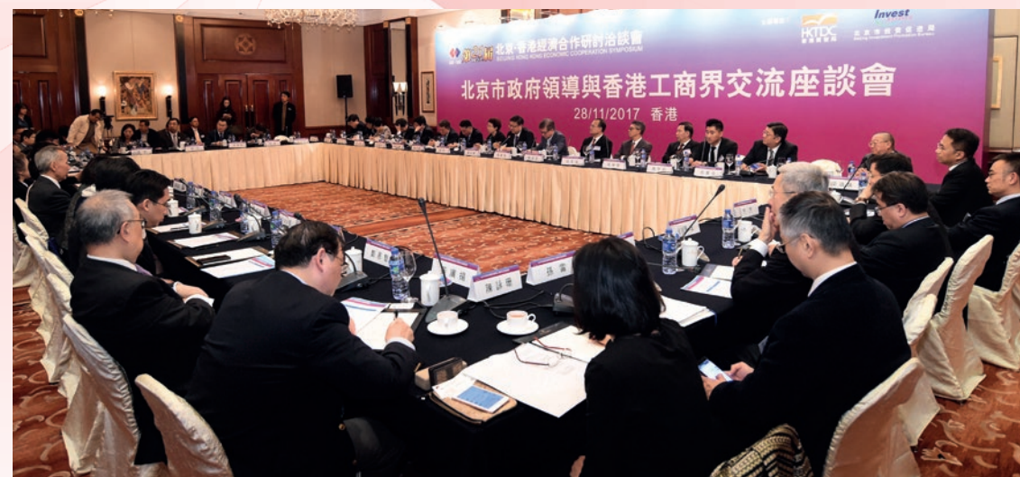
▲ 京港經濟合作研討洽談會探討京港在不同領域的合作機會。 The Beijing Hong Kong Economic Cooperation Symposium discussed the cooperation between the two cities in various areas.

The 18th high-level roundtable meeting among major chambers of commerce in Hong Kong, Guangdong and Macau was held at the Macao Chamber of Commerce. Representatives from various chambers in the three places joined together to discuss how the chambers of commerce can play a role in the construction of the Guangdong-Hong Kong-Macao Greater Bay Area, and promote the enterprises in the three places to grasp this development opportunity. (4/12)