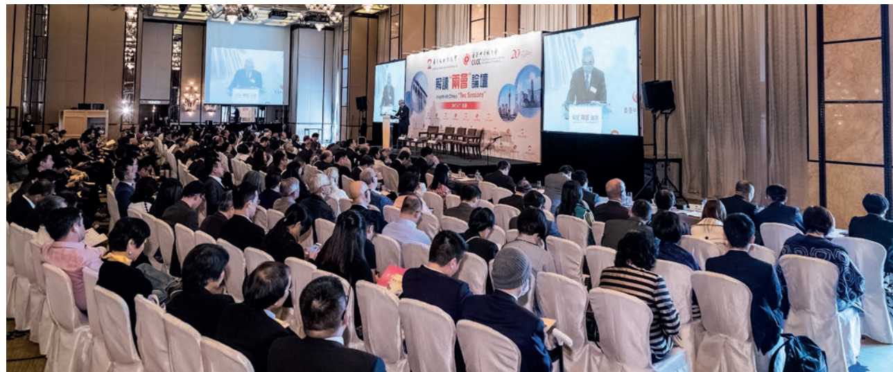
▲ 解讀“兩會”論壇吸引近300位嘉賓出席。 Nearly 300 guests attend the “Insights into China’s ‘Two Sessions’” Forum.