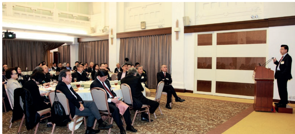
▶ 年內舉行多元化專題講座。 Seminars held in the year covered various topics.

In 2017, a total of 3 sessions (218th – 220th sessions) were organized under the program for 82 participants. Since its inception from 1982, 7,728 participants have completed the program.