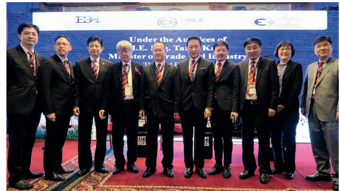
▲ 一帶一路工商論壇連繫香港、內地與非洲、阿拉伯國家。 Belt and Road Industrial & Commercial Conference linked Hong Kong and the Mainland with African and Arabian countries.

To explore cooperation opportunities in the establishments of the “Belt and Road” between Hong Kong and Egypt, and also introduce Hong Kong’s advantageous industries to the political and business leaders from Egypt and other African and Arabian countries, the Chamber participated in the “Belt and Road Industrial & Commercial Conference” in Cairo, Egypt. Participants exchanged views on the economic prospect and business opportunities among the member states of the Belt and Road Industrial and Commercial Alliance (BRICA), and the promotion of bilateral and multilateral economic ties. The forum also included seminars on finance, logistics and e-commerce etc. (1/4)