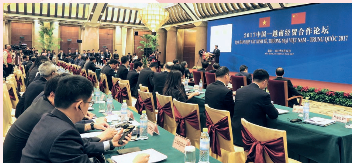
▲ 中國-越南經貿合作論壇探討中越經貿合作前景。 Vietnam-China Economic-Trade Cooperation Seminar discussed prospects of cooperation between China and Vietnam.