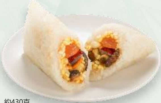
約430克 Approx. 430g