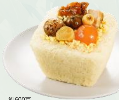
約600克 Approx. 600g