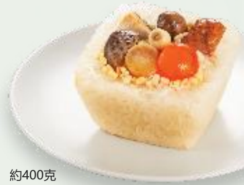
約400克 Approx. 400g