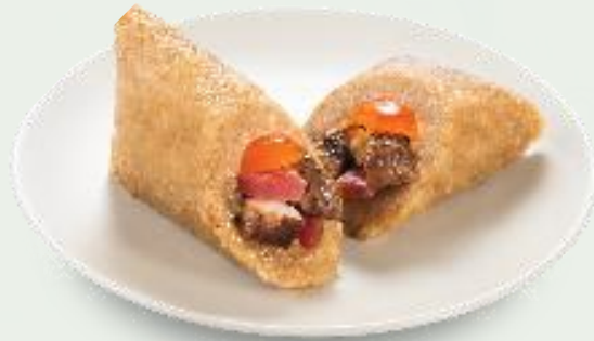
約270克 Approx. 270g