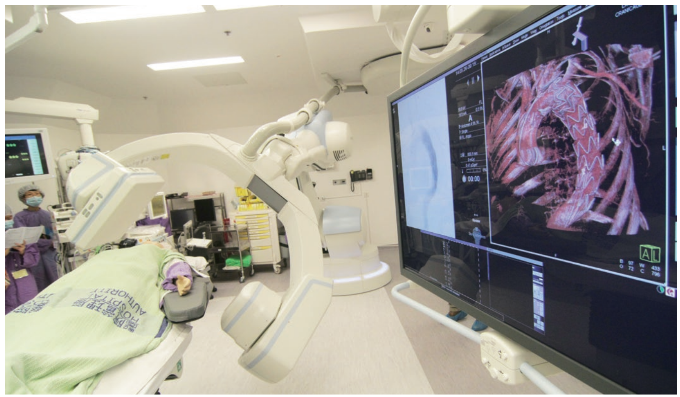
中大威爾斯親王醫院很早已引進"C 形機械臂影像裝置",並成立心血管混合手術室。 CUHK and Prince of Wales Hospital has long equipped with the "Robotic C-arm Imaging Device" and established the Hybrid Cardiovascular Operating Theatre.