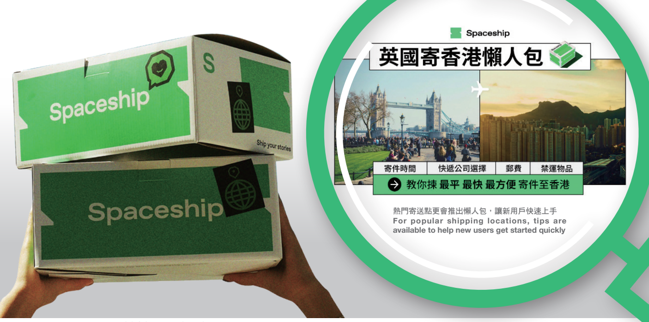
公司名其實由物流兩大要素 Space ( 倉存 ) 和 Ship ( 運送 ) 組成 <sup>,</sup> 湊起來剛好是 Spaceship( 太空船 ) The company's name is actually composed of Space (warehousing) and Ship (delivery), both of which are elements of logistics