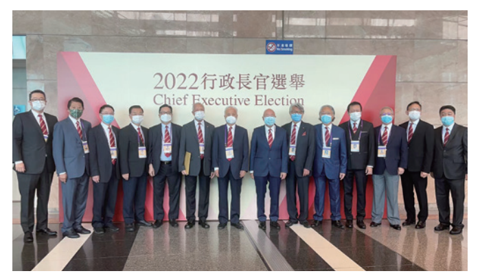
12 期望新任行政長官帶領香港譜寫新篇 Looking to the New Chief Executive Leading Hong Kong into a New Chapter