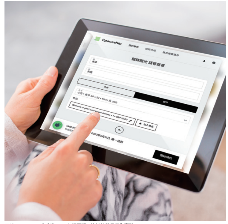
目前 Spaceship 分手機 APP 和網頁版<sup>,</sup>皆以簡單易用為賣點 Spaceship is currently available as mobile app and web versions, both with ease of use as their selling point

在存亡之際,二人重新檢視整家 公司,發現物流這個環節,在 電子商貿中其實是最必需、也 是最不可或缺的,因此毅然決 定把公司"斬件",只留下物流 業務重點發展。"經歷數個月艱 苦轉型,2019年中終於出現了 Spaceship 的早期版本,感恩開