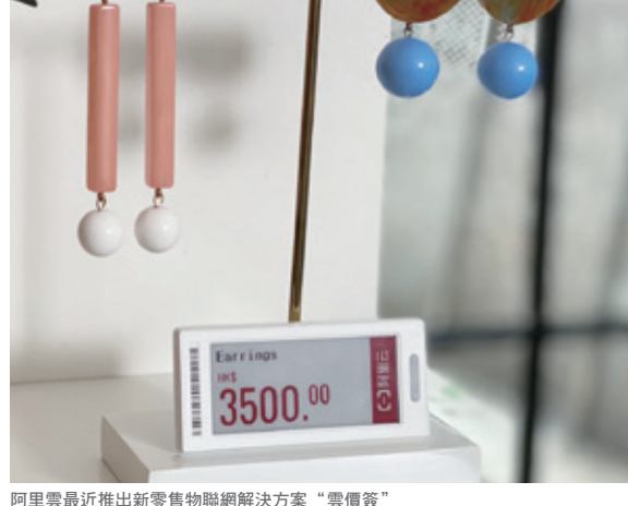
阿里雲最近推出新零售物聯網解決方案 "雲價簽" Alibaba Cloud has recently launched a new retail IoT solution known as Cloud ESL.