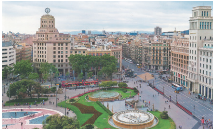
西班牙巴塞羅那加泰羅尼亞廣場。 Catalonia Square, Barcelona, Spain.