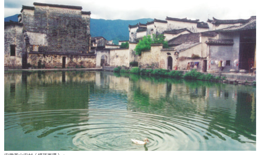
安徽黃山宏村。 Hongcun, Huangshan, Anhui Province.

arlier, the Hong Kong Museum of Art and the Uffizi Gallery of Italy jointly held a thematic exhibition featuring the latter's exhibits. The Uffizi Gallery owes its creation entirely to the funding support from the House of Medici