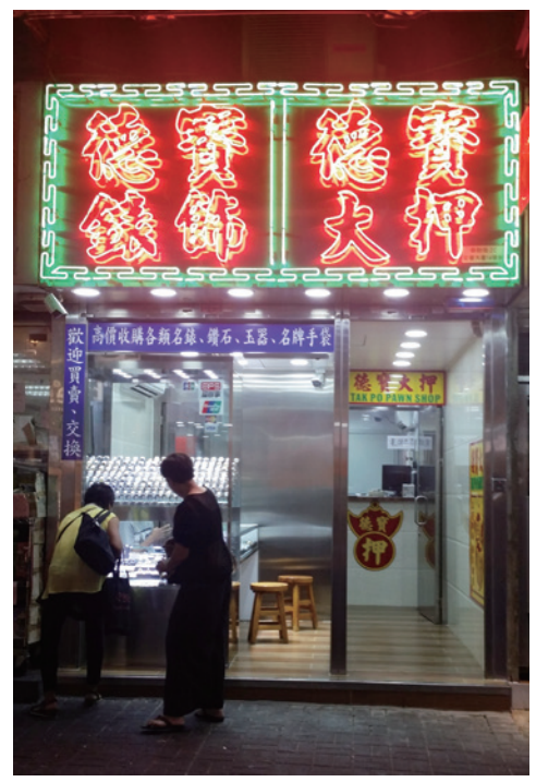
有當舗直接在隔壁開設零售店,轉售流當品。 Some pawnshops opened retail stores next door to sell pawned items that were not redeemed by their owners.