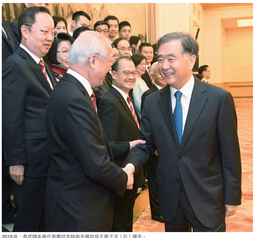
2019年,哀式随本管代表團訪京時與全國政協王席注注(石)歷主。 In 2019, Yuen shook hands with Chairman of the CPPCC National Committee Wang Yang (right), during the Chamber's delegation to Beijing.

經濟不景氣,基層生活艱難,袁武認為此刻他們更需要支援與關懷。他指出,如欲經濟邁步向前,還須仰理會和諧,而中總一直深明此理一直和。 在"愛心行動"等公益事務上一直於力,例如早前在疫情最嚴峻上一直的發防疫,中總一眾首長亦有聯同成員武時候,中總一眾首長可心抗疫。袁克情則與市民同心抗疫。在疫情可以,在疫情不要應繼續,故未來中總將持續與一眾社團機構合作,攜手為社會送暖。