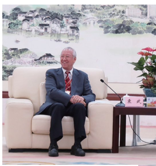
袁武(左)率團考察東莞濱海灣新區規劃,並與當地領導會面。 Yuen (left) led a delegation to the Binhai Bay New Area in Dongguan to meet with local officials.

subsequent global havoc wreaked by the coronavirus pandemic. Yuen believed that it is now paramount to contain the virus and to strive for early economic recovery.