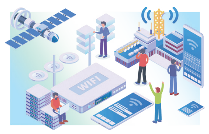
5G 技術憑藉傳輸高速、低時延及優良連接性,有助不同產業突破原來的運作模式。 5G technology helps different industries go beyond their existing modes of operation through high-speed transmission, low latency and excellent connectivity.

出,其中3.5GHz 在沙田、大埔與衛星站附近,存在可能干擾的問題。但香港除3.5GHz 外,尚有多個頻段可作商用,因此並不影響5G 在香港的整體發展。政府正着手與業界尋求3.5GHz 干擾問題的解決方案,而應科院也積極與政府及各持份者,探討3.5GHz 在大埔及沙田的5G 室內方案可能性,務求將潛在影響降到最低。