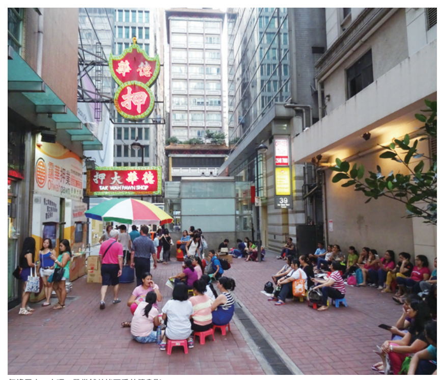
每逢周末,中環一帶當舖前皆不乏外傭身影。 There is no shortage of FDHs in front of the pawnshops in Central every weekend.