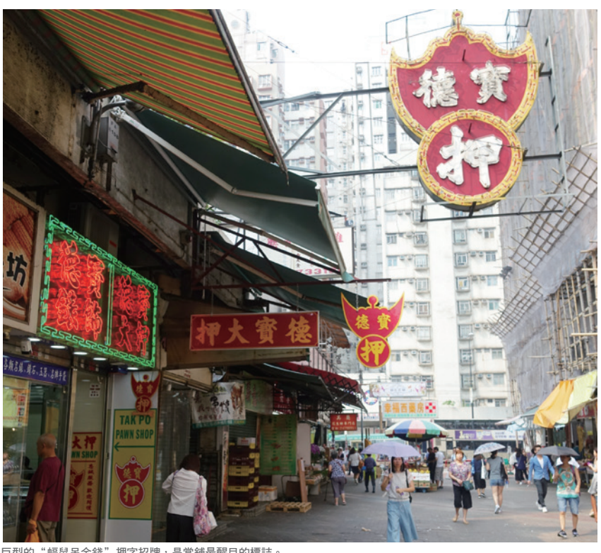
巨型的"蝠鼠吊金錢"押字招牌,是當舖最醒目的標誌 The most eye-catching symbol of a pawnshop is a huge sign of a bat holding a coin.

"有一次我到荃灣的當舖做研究,本 身不是為典當。但因我的學校在葵 涌,當我步出時,發現一位行人很像 某位家長,我立時感到有點尷尬。可 見去當舖,的確帶來某種心理壓力。" 至於那個比人還要高的櫃枱,據說是 讓"二叔公"有高高在上的感覺,令 客人自覺有求於人,議價能力自然降 低。但徐振邦認為,高櫃枱的設計其 實更多是出於防盜考慮。"高大的櫃 枱、前面架有鐵支,具備高效的防盜 功能;而二叔公身處的高位,不但可 俯瞰店內全貌,更能窺看街道情況。 相反店外人的視線則會被遮醜板所