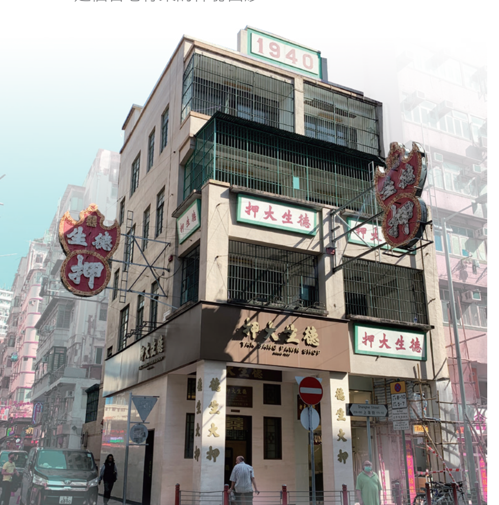
傳統當舖多為全棟多層物業,但城市發展下,已所剩無幾。 Traditional pawnshops were mostly housed in multi-storey buildings, but not many of them are left due to urbanization.

Pawnshops often seem mysterious to many people, but a secondary school teacher devoted three years of his life visiting various pawnshops of different sizes across Hong Kong, with the aim to uncover the mystery of this old industry.