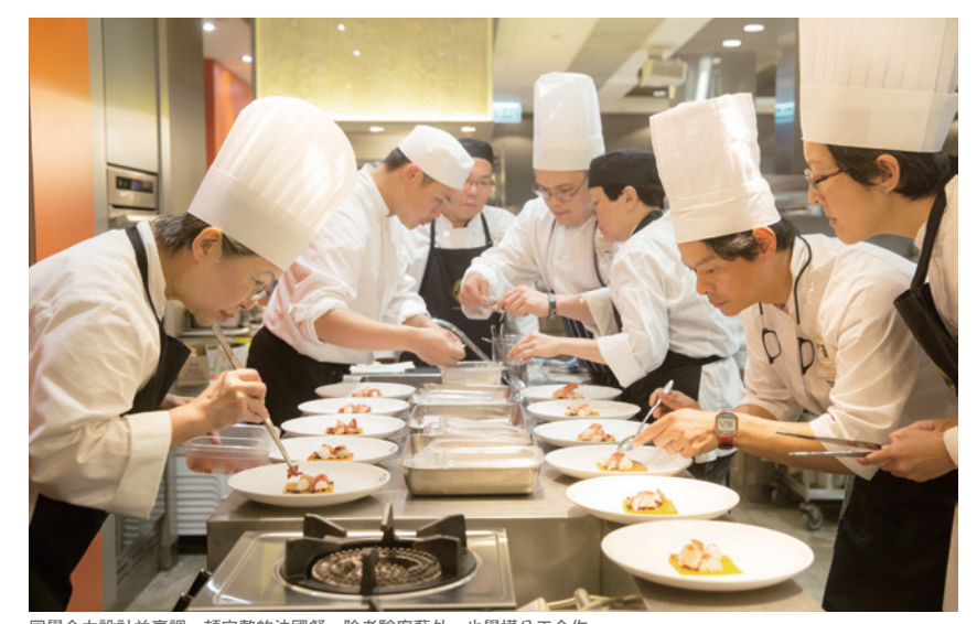
同學合力設計並烹調一頓完整的法國餐,除考驗廚藝外,也學懂分工合作。 The students designed and cooked a full French meal together. Not only does it test their culinary skills, but they can also learn about teamwork.

international renown chefs to cook a variety of French dishes or pastry, thus fulfilling their dream of becoming a master chef or even opening a restaurant in France.