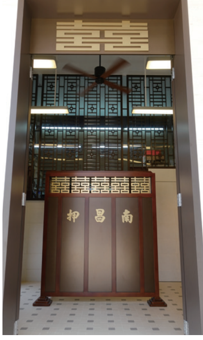
當舖的遮醷板,可減少典當者的尷尬。 A pawnshop's shield can reduce the embarrassment felt by its customers.