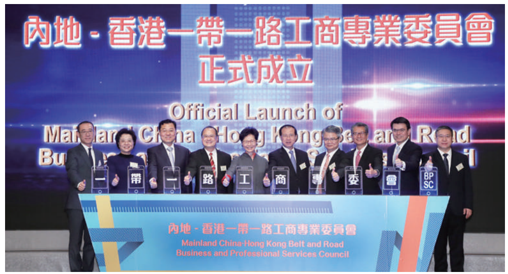
"內地—香港一帶一路工商專業委員會" 由超過40家香港及內地主要商會、專業團體及大型企業組成。 The BRBPSC is composed of over 40 major business associations, professional bodies and large enterprises in Hong Kong and the Mainland.