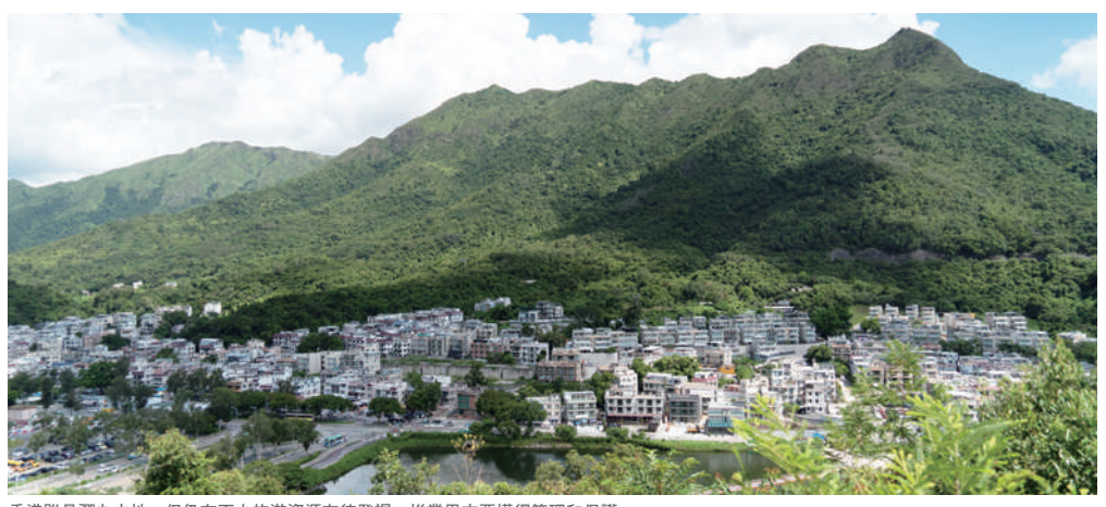
香港雖是彈丸之地,但仍有不少旅遊資源有待發掘,惟業界亦要懂得管理和保護。 Local Travel industry must uncover more resources and learn how to protect and manage them.

在此嚴峻情況下,不少旅行社為求生存,紛紛把目光轉往開拓本地遊。今年六月,政府亦推出"綠色生活本地遊鼓勵計劃",為業界提供財政支援。惟謝宇德表示,2003年沙士重創旅遊業時,當時政府同樣提倡本地遊,但17年後的今天,能一直堅持經營本地遊的旅行社,則仍屬少數。"計劃雖能吸引旅行社發展本地遊,但要令本地