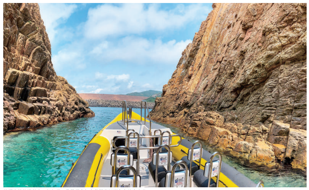
綠恒生態旅遊其中一個行程,是帶領參加者欣賞甕缸群島上的火山岩。 Participants in this EcoTravel tour are guided to appreciate the volcanic rock on the Ung Kong Group.

然環境的承載力、做好旅遊資源的保護,導賞員亦要懂得管理遊客秩序。由於後來大埔滘的遊覽人數過多,我們便停辦該行程了。"謝宇德期望,隨着本地遊逐漸普及,香港可參考澳洲推出生態旅遊標章認證,在提高業界標準之餘,亦有助消費者選擇優質的本地遊。◆