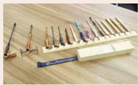
書寫西洋書法有不同的工具,除了傳統的沾水筆外,亦有手工製作的羽毛筆、可樂筆、現代的 marker、軟頭筆。 There are a wide range of tools for western calligraphy. Apart from traditional fountain pen, you can also use handmade feather pen, Coca Cola pen, modern marker and brush pen.