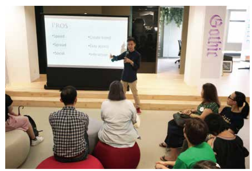
去年首次舉辦書法曰,透過講座、工作坊、作品展覽向公眾推廣西洋書法。 The Society organized its first Calligraphy Day to promote western calligraphy through seminar, workshop and exhibition last year.

were few. However, as more and more people share their passion for western calligraphy on social media, the number of both instructors and learners has grown in the last decade.