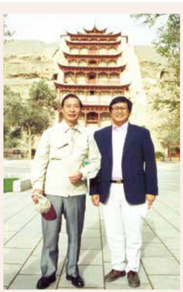
2000 年,作者與本地著名企業家李兆基(左)於 莫高窟。