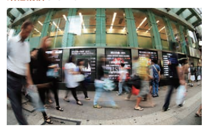
7 虚擬銀行:傳統銀行的對手還是出路? Virtual Banks: Conventional Banks' Rival or Solution?