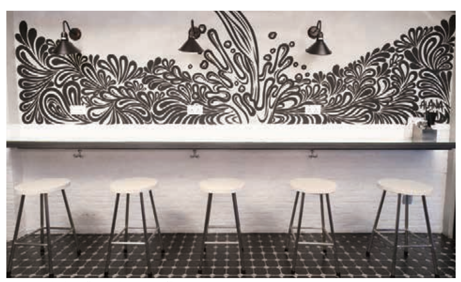
吧枱位的巨型壁畫,由著名藝術家 Alana Tsui 操刀。 The giant mural at the bar was painted by the celebrated artist Alana Tsui.