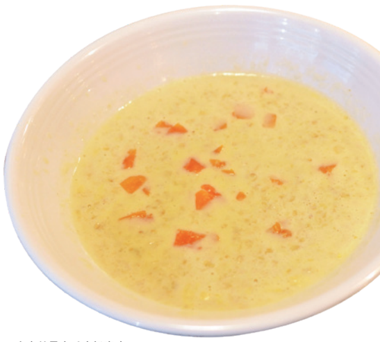
十字芒果木瓜牛奶麥皮 Cross Cafe's mango and papaya milk oatmeal