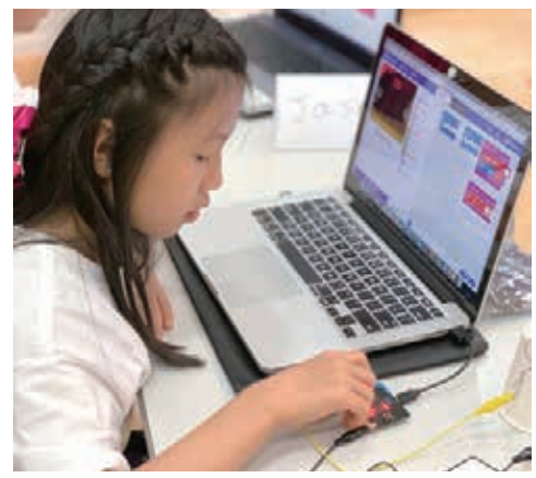
GLOs 與新加坡的夥伴合作,為兒童提供編程教育。 GLOs teams up with Singapore partner to offer coding education

麼是公平咖啡等,這是因為我們喜歡咖啡,才衍生了對這些知識的興趣與追求,是一種由小見大、edutainment(寓教育於娛樂)的概念。"透過連繫生活上許多零碎事情,從中建立一些可以產生協同效應的"education plus"("教育+")產業,就是沈旭暉推動國際關係產業化的初衷。