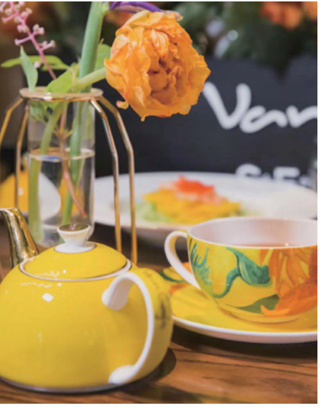
同樣以梵高名畫《向日葵》為設計概念的骨瓷茶具套裝。 The porcelain tea set was also designed with Van Gogh's famous painting Sunflower as the concept.

反觀內地市場,不但市場龐大,且人 們更樂於接受新事物,同時銷售途徑 多元化,並不局限於透過門市出售, 因此朗智集團的藝術授權項目大都以 內地為主。她又補充,內地的消費者 對於藝術充滿好奇,在港舉辦的巴塞 爾藝術展,每年都吸引眾多內地人參 觀,反映他們非常渴求藝術和文化。 朗智集團未來會計劃將海外的展覽帶 進內地,並以數碼化、互動等方式向 觀眾呈現。