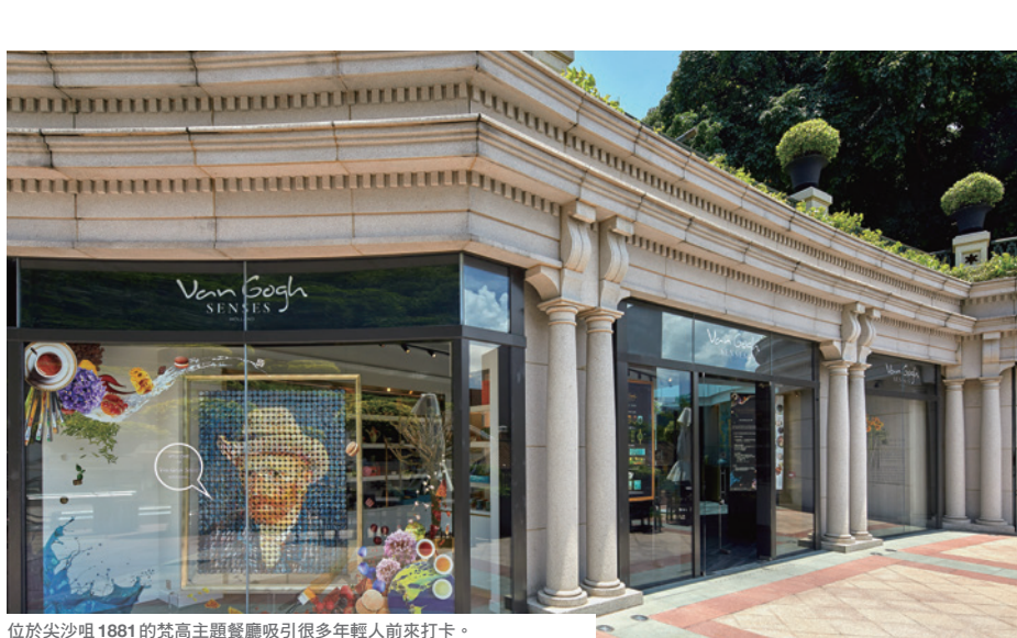
位於尖沙咀1881的兌局王題贊廳吸引很多年輕人前來打卡。 Van Gogh SENSES at 1881 Tsim Sha Tsui attracts a lot of young people.