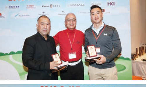
2018 Golf Tournament