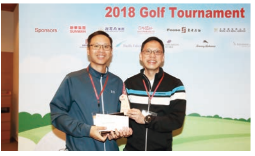
2018 Golf Tournament