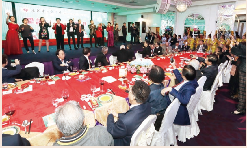
地區事務委員會亦舉辦會員聖誕聯歡 晚會,席間設歌舞表演及抽獎環節, 場面熱鬧。❹

The District Affairs Committee also co-hosted a Christmas party. Attendees enjoyed a wonderful night with entertainments including performance shows and lucky draws. (18/12)