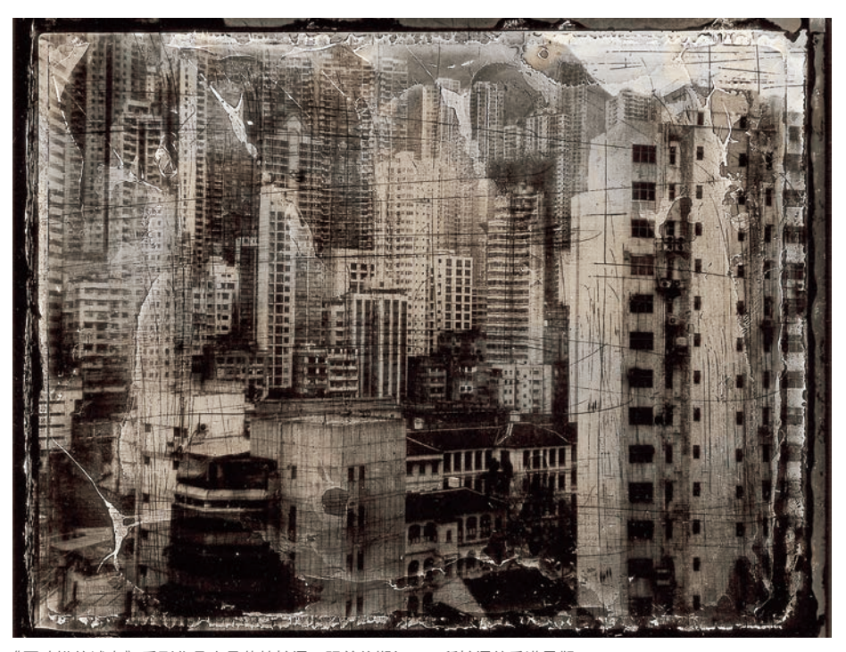
《再建構的城市》系列作品也是菲林拍攝,跟着後期加工,所拍攝的香港景觀。 The Reconstructing a City series of So's works on Hong Kong's landscape were also shot with films, and then underwent post-photographic manipulation.

Turning to the past when photography was not yet popular, So said: "At that time, photography was a plaything for rich people." Most people took pictures only at