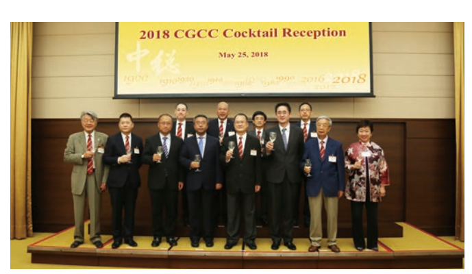
46 各國領事聚首一堂 Consuls Mingled at Cocktail Reception