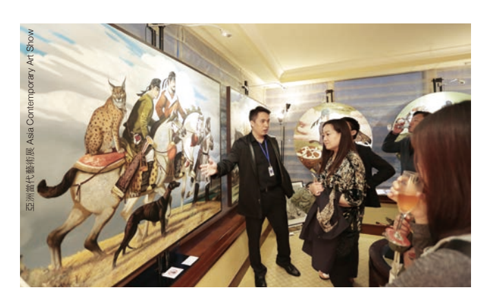
13 香港:藝術貿易要塞 Hong Kong: Hub for Art Trade