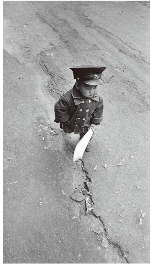
這是《第一個印象中國1981》系列中的其中一張作品。相片中的小孩子身穿軍服,手握一把假刀,大搖大擺地走在有條裂縫的路上,構成"小孩劈開路障"的錯覺。 This is from the First Impression China 1981 series. In military uniform and holding a fake saber, the child in the photo walked arrogantly on a cracked road, which gives the illusion that the child is breaking down a roadblock.