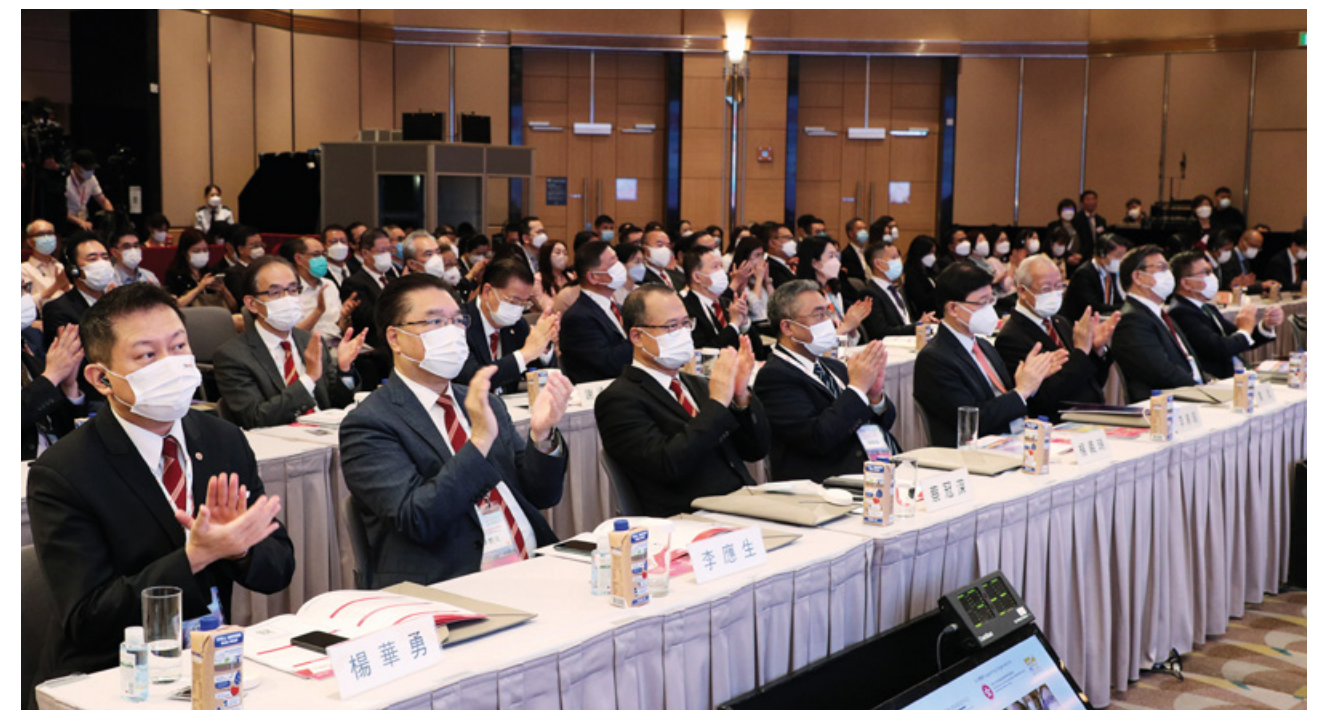
與會者細心聆聽一眾演講嘉賓發言 Participants listen to the speeches delivered by various speakers

The Summit was an accredited event celebrating the 25th Anniversary of the Establishment of the HKSAR. Supporting organizations included the HKSAR Government and the Hong Kong Trade Development Council. Several chambers of commerce and business organizations from Hong Kong and East Asia were the participating organizations. There was live streaming for the Summit with nearly 1,000 physical and virtual participants. (17/8)