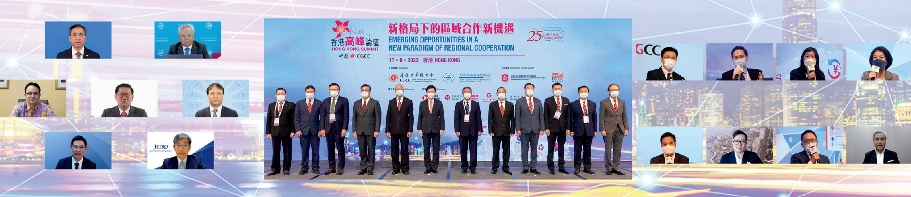
主禮嘉賓、演講嘉賓與本會首長合照 Officiating guests, speakers and the Chamber's office-bearers pose on the stage